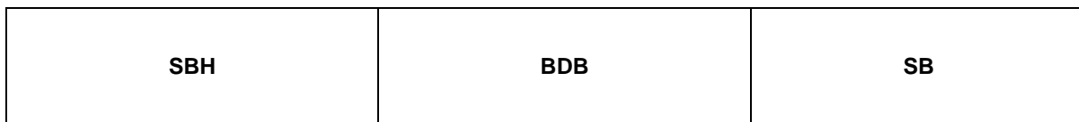
Figure 1 – CBEFF Record Sections

SBH – Standard Biometric Header, BDB – Biometric Data Block, SB – Signature Block.