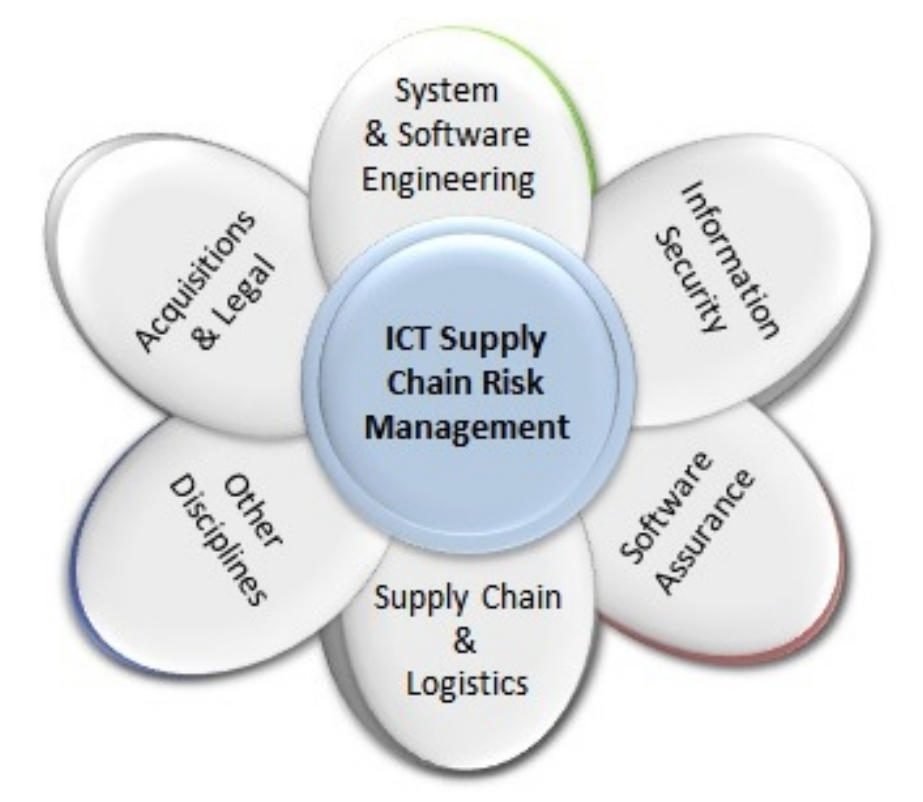
Figure 1. Components and Contributing Disciplines of ICT SCRM

To be successful, federal departments and agencies need to achieve a certain level of maturity in these multiple disciplines and ascertain that they have successfully implemented and standardized basic business practices. Basic practices include ensuring that federal department and agency acquirers understand the cost and scheduling constraints of the practices, integrating information security requirements into the acquisition language, using applicable baseline security controls as one of the sources for security requirements, ensuring a robust software quality control process, and establishing multiple delivery routes for critical system elements.