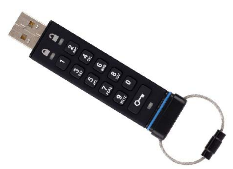
Figure 1 – Apricorn Aegis Secure Key cryptographic boundary showing input buttons and status LEDs