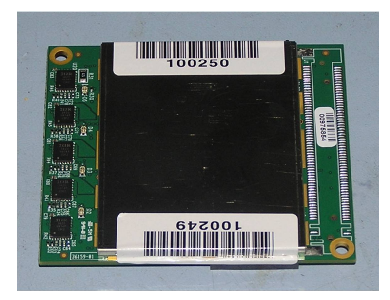
Figure 1 – 3e-520 Secure Access Point Cryptographic Module

The figure below shows the 3e-520 Secure Access Point Cryptographic Module.