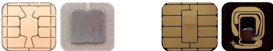
Figure 1 – Contact only: P-M4.8-8-1 front and back (left); S-MFC6.8 front and back (right)

The contactless ports of the module require connection to an antenna. The module relies on [ISO7816] and [ISO14443] card readers as input/output devices.