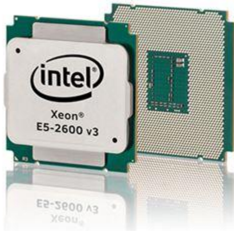
Figure 3 – Physical Cryptographic Hardware for AES-NI

All other platforms supported by Vormetric are “Vendor Affirmed” to be FIPS 140-2 compliant as per FIPS Implementation Guidance section G.5. The CMVP allows vendor porting of a validated level 1 software-hybrid cryptographic module running on a CPU supporting the AES-NI instruction set from the GPC(s) specified on the validation certificate to a GPC that was not included as part of the validation status, as long as no source code modifications are required. The validation status is maintained on the new GPC without re-testing the cryptographic module on the new GPC. The CMVP makes no statement as to the correct operation of the module when so ported if the specific operational environment is not listed on the validation certificate.