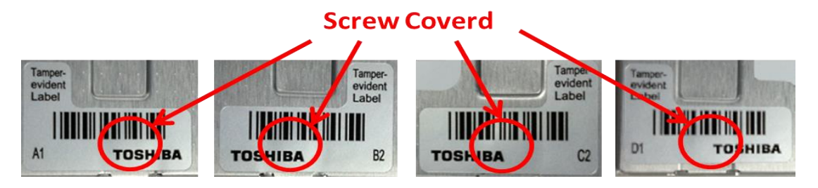
CORNER SEAL A CORNER SEAL B CORNER SEAL C CORNER SEAL D (PX02SMU020/040/080)