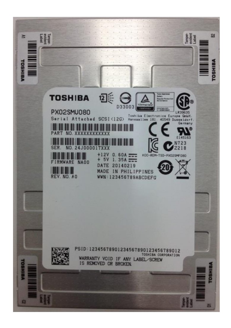
TOSHIBA CORPORATION {\rm Rev}~2.0