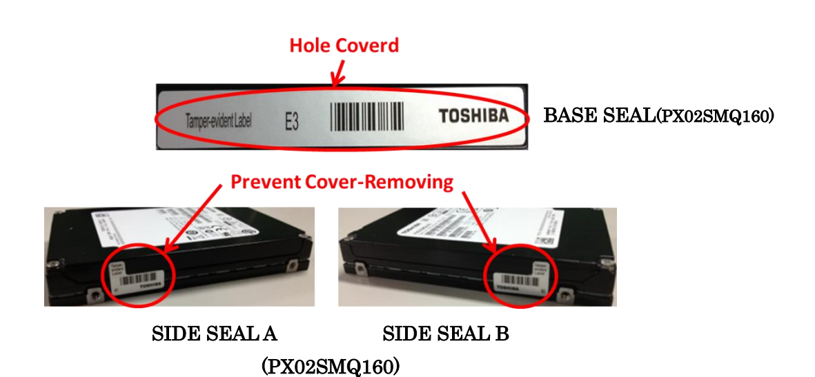
Jul 15, 2016