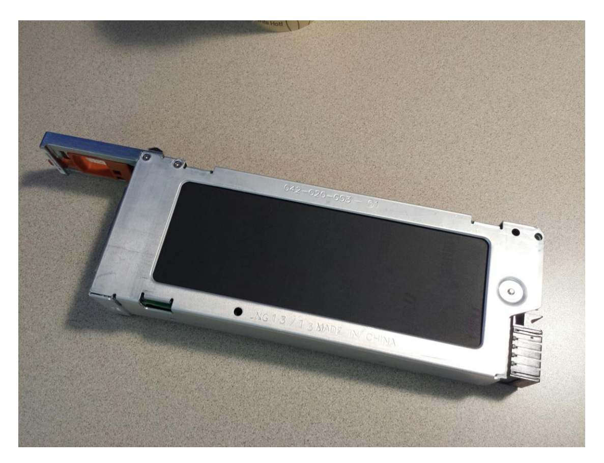
Figure 2 – Physical Boundary (Bottom)

No components are excluded from validation. The module encrypts and decrypts data using only a FIPS-approved mode of operation. It does not have any functional non-approved modes or bypass capability.