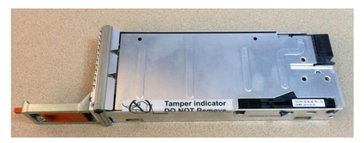
Figure 1 – Physical Boundary (Top)

The module is Dell EMC's VMAX 6 Gb/s SAS I/O Module with Encryption, Part Number 303-161-101B-05 running firmware version 2.13.39.00 or 2.13.43.00. It is classified as a multi-chip embedded hardware cryptographic module, and the physical cryptographic boundary is defined as the module board, controller, flash memory, and interfaces as depicted in Figure 2 – Physical Boundary below.