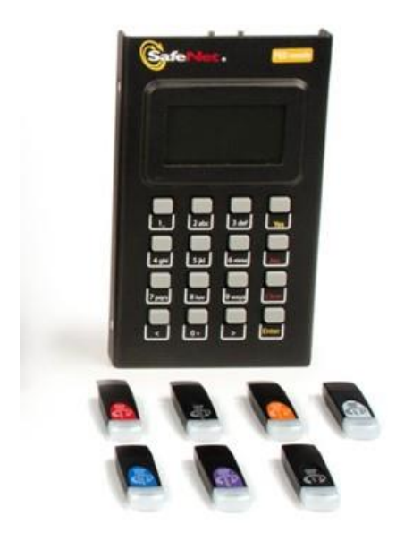
Figure 3-1. Luna PED and iKeys