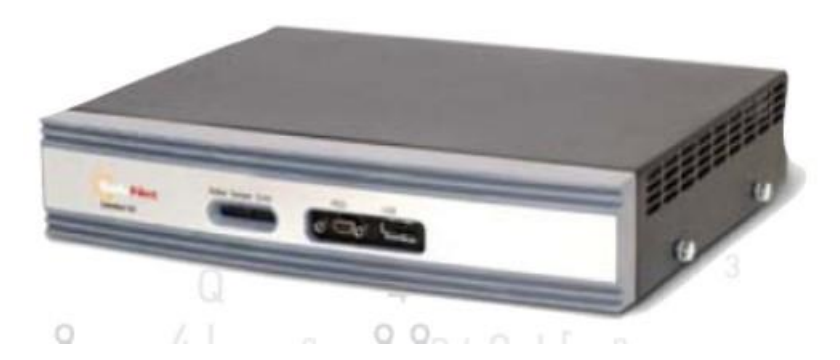
Figure 2-1. Luna Backup HSM Cryptographic Module (with front bezel attached)

This Security Policy is specifically written for the Luna Backup HSM cryptographic module in a Trusted Path Authentication (FIPS Level 3) configuration.