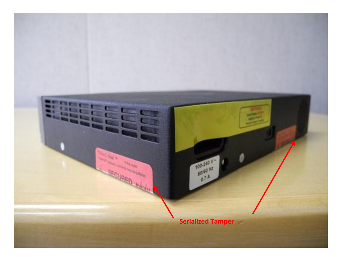
Figure 3-2. Use of Serialized Tamper Evident Labels on Luna Backup HSM