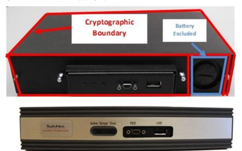
Figure 2-2. Luna G5 Cryptographic Boundary (with front bezel removed)