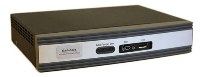
Figure 2-1. Luna G5 Cryptographic Module (with front bezel attached)