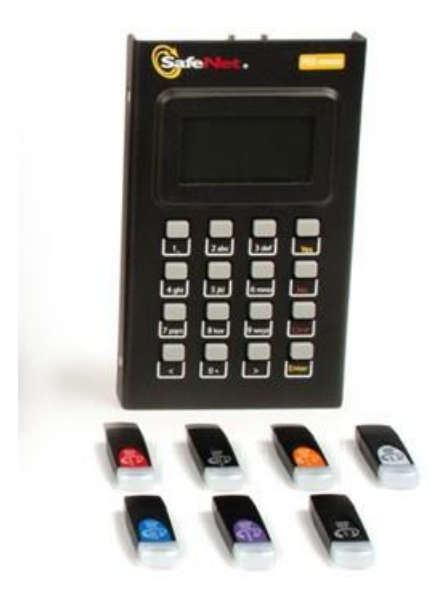
Figure 3-1. Luna PED and iKeys