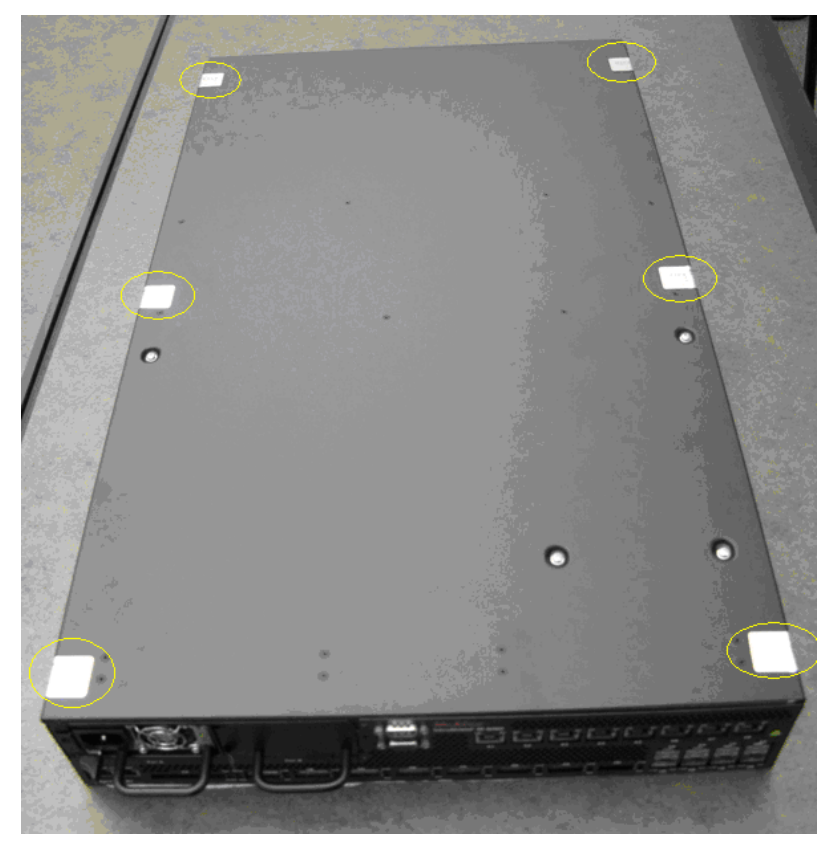
Figure 4 – Tamper Label Placement

Figure 4 depicts the tamper label locations on the cryptographic module. There are 6 tamper labels and they are circled in yellow.