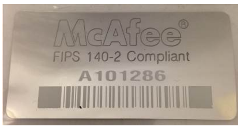
Figure 5 - Tamper Label