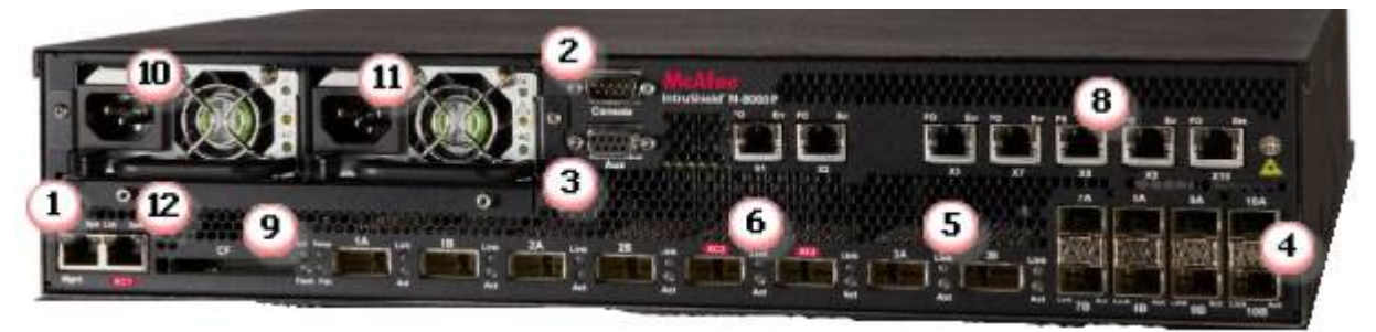
Table 2 provides the cryptographic module's ports and interfaces.

Figure 2 – M 8000 P Front Panel (with Power Supply Trays Populated)