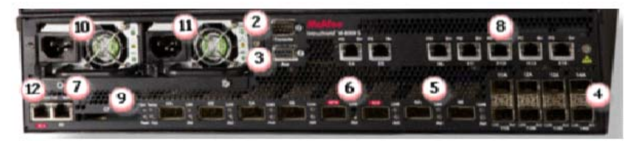
Figure 2 - M 8000 S Front Panel (with Power Supply Trays Populated)

Table 2 provides the cryptographic module's ports and interfaces.