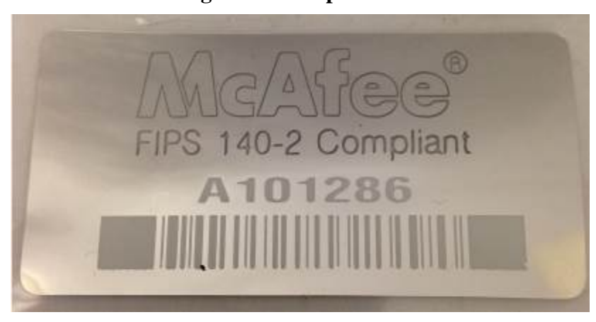
Figure 5 - Tamper Label