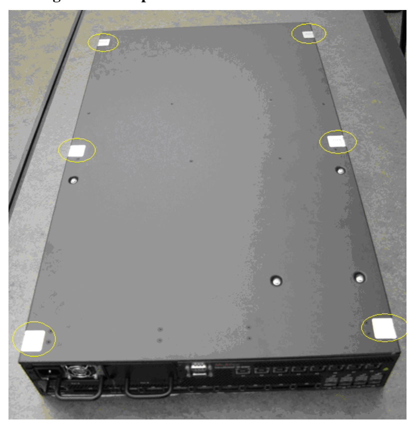
Figure 4 - Tamper Label Placement for M-8000 S

Figure 4 depicts the tamper label locations on the cryptographic module. There are 6 tamper labels and they are circled in yellow.