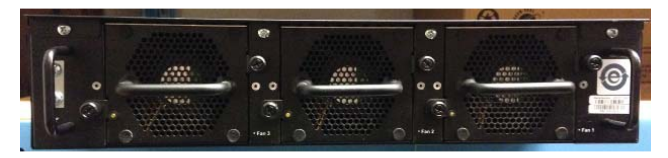
Figure 3 - Rear Panel of M-8000 S (No Ports)