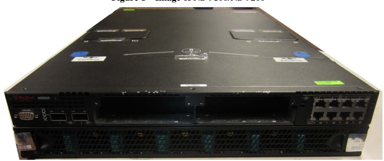
Figure 1 – Image of NS-9100/NS-9200

Figure 1 shows the module configuration and the cryptographic boundaries.