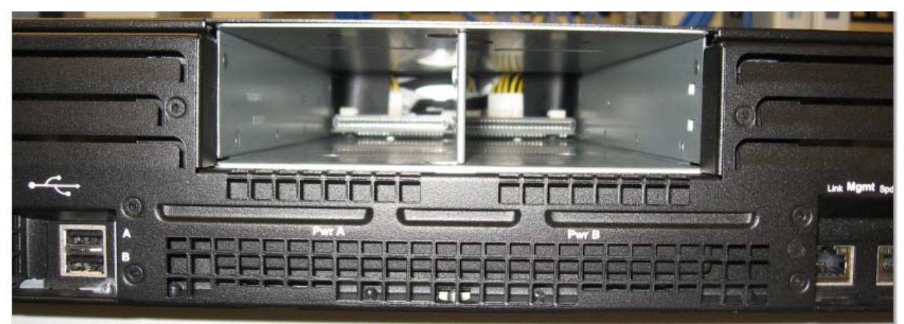
Figure 5 - Rear panel with Power supplies removed

The module supports the following communication channels with the Network Security Platform (NSP) Manager: