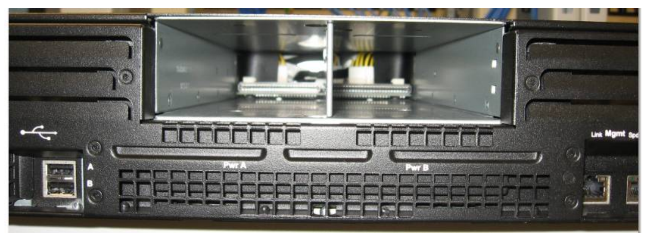
Figure 6 - Rear Panel with Power Supplies Removed