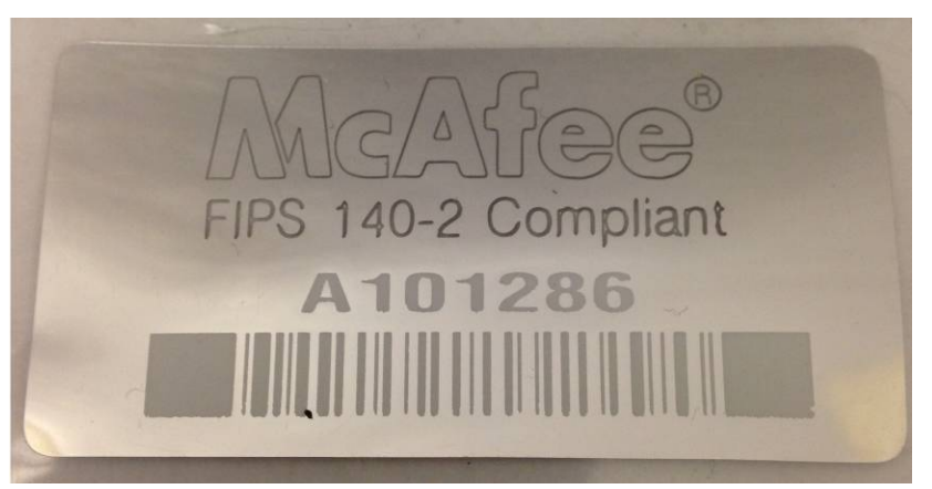
Figure 8 - Tamper Label

Note: The NS-9300 S enclosure is identical to the NS-9200, which is shown here.