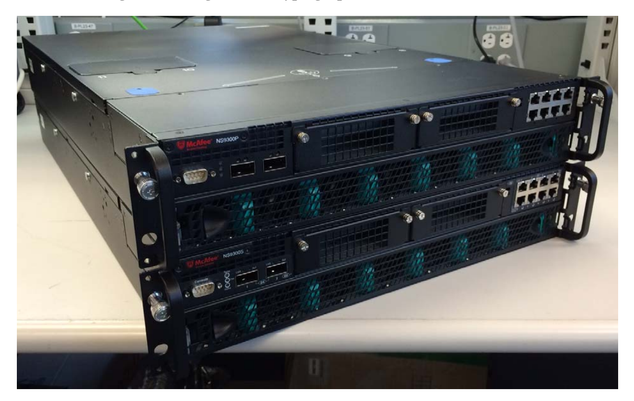
Figure 2 – Image of the Cryptographic Module with NS-9300 P