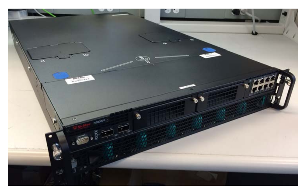
Figure 1 – Image of the Cryptographic Module

Figure 1 shows the module and its cryptographic boundary.