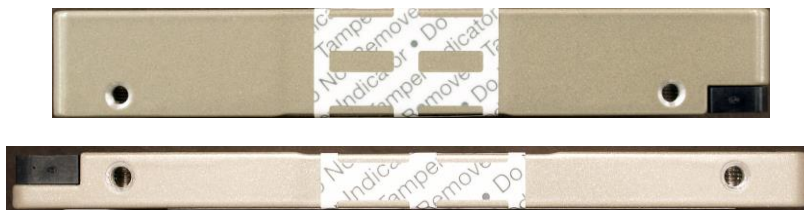
Figure 3: Right-side view of tamper-evidence label on right side of drive