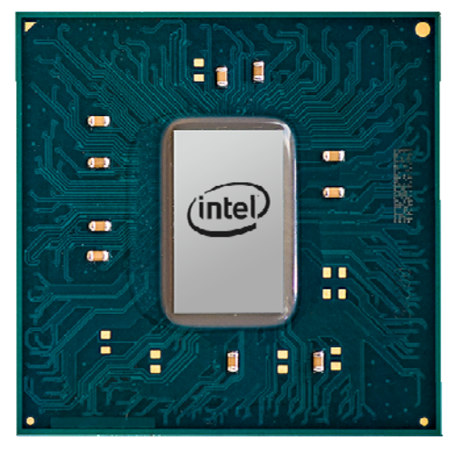
Figure 1 – Intel PCH chipset

Table 1 - Cryptographic Module Components