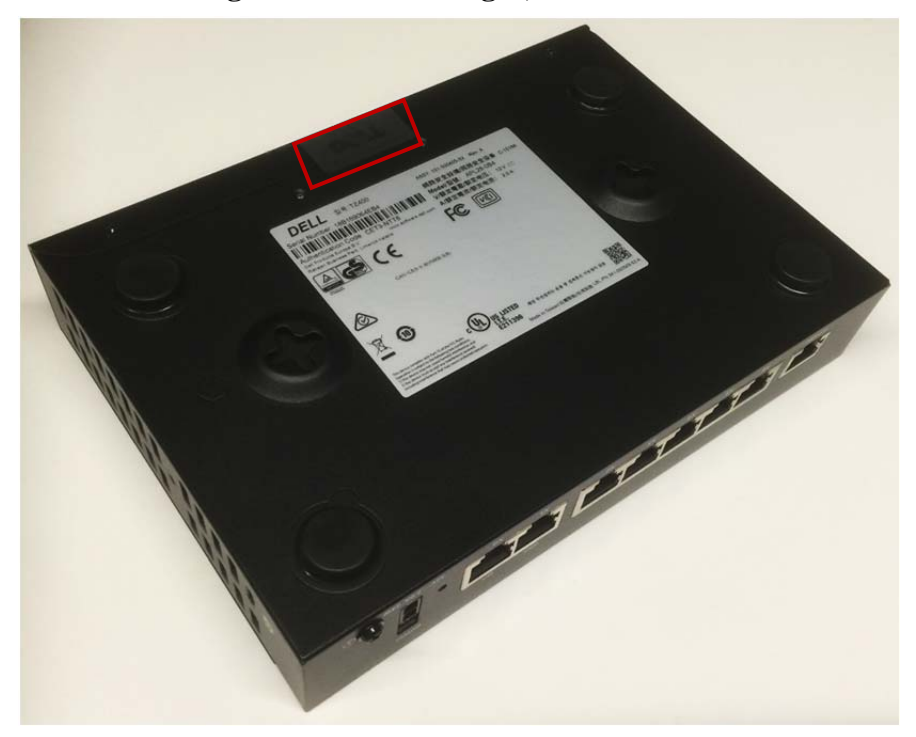
Figure 6: TZ400 Right, Bottom View