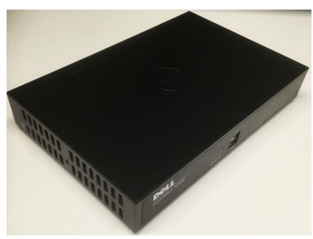
Figure 3: TZ500 (Top, Left)