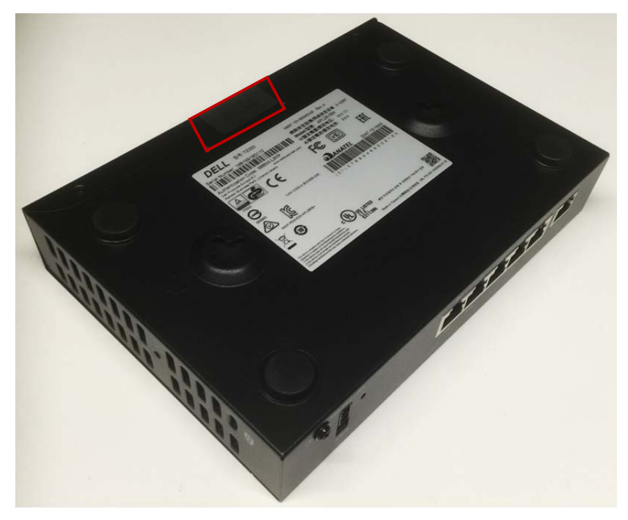
Figure 5: TZ300 - Right, Bottom View