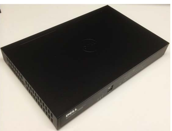
Figure 4: TZ600 (Top, Left)