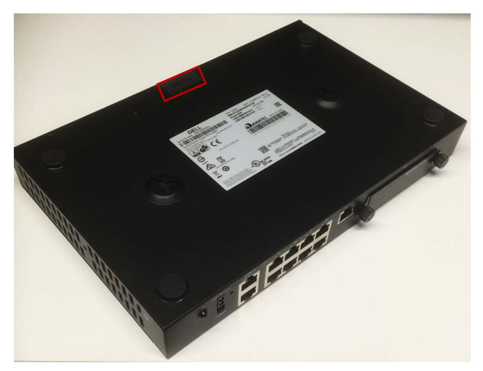
Figure 8: TZ600 Right, Bottom