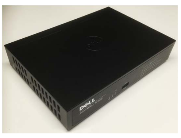
Figure 2: TZ400 (Top, Left)