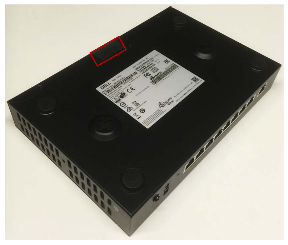
Figure 7: TZ500 Right, Bottom View