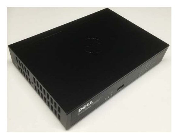
Figure 1: TZ300 (Top, Left)

The chassis of all the modules are sealed with one (1) tamper-evident seal, applied during manufacturing. The physical security of the module is intact if there is no evidence of tampering with the seals. The locations of the tamper-evident seals are indicated by the red rectangles below in Figures 6 through 9: The Cryptographic Officer shall inspect the tamper seals for signs of tamper evidence once every six months. If evidence of tamper is found, the Cryptographic Officer is requested to follow their internal IT policies which may include either replacing the unit or resetting the unit to factory defaults. For further instructions on resetting to factory defaults, please review SonicWALL guidance documentation.