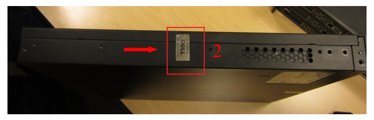
Figure 3 - NSA 6600 Tamper-Evident Seal Location on Left Side