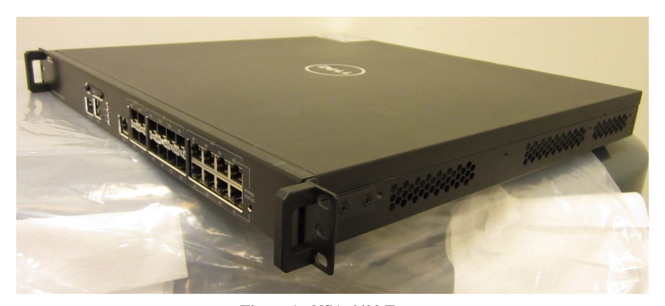
Figure 1 - NSA 6600 Front

The chassis of all the modules are sealed with two (2) tamper-evident seals, which are applied during manufacturing. The physical security of the module is intact if there is no evidence of tampering with the seals. The locations of the tamper-evident seals are indicated by the red arrows in the figures below. The Cryptographic Officer shall inspect the tamper seals for signs of tamper evidence once every six months. If evidence of tamper is found, the Cryptographic Officer is requested to follow their internal IT policies which may include either replacing the unit or resetting the unit to factory defaults. For further instructions on resetting to factory defaults, please review Sonicwall guidance documentation.