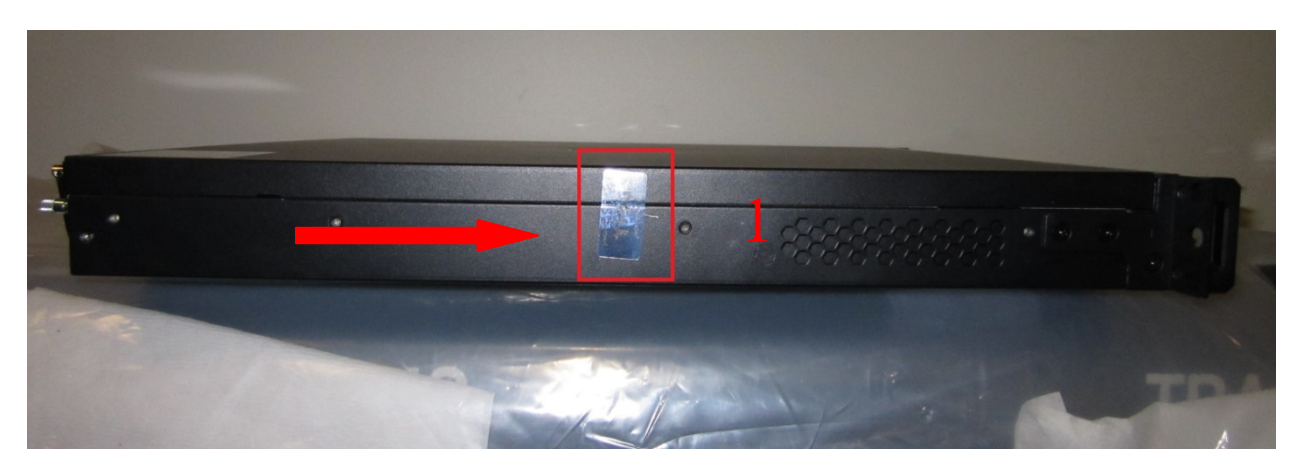
Figure 4 – SM Chassis with Tamper-Evident Seal Location on Left Side