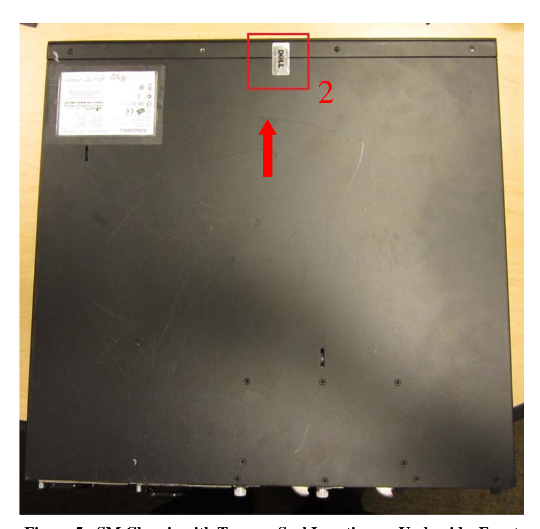
Figure 5 - SM Chassis with Tamper Seal Location on Underside, Front