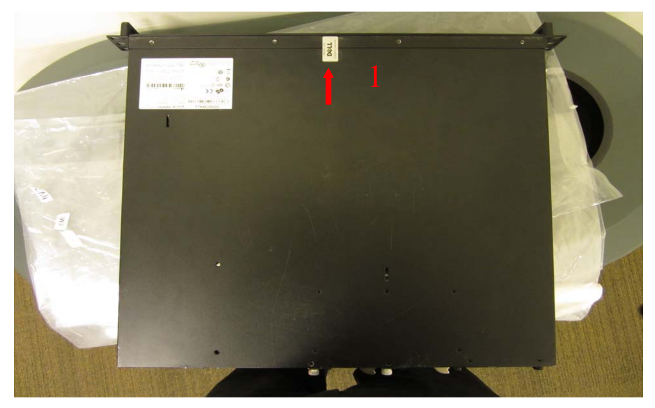
Figure 2 - NSA 6600 Tamper Seal Location on Underside, Front