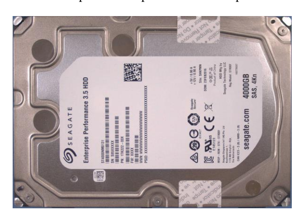
Figure 1: Top view of tamper-evidence label on sides of Enterprise Performance HDD v1, 3.5-inch, 10K-RPM, SAS Interface module