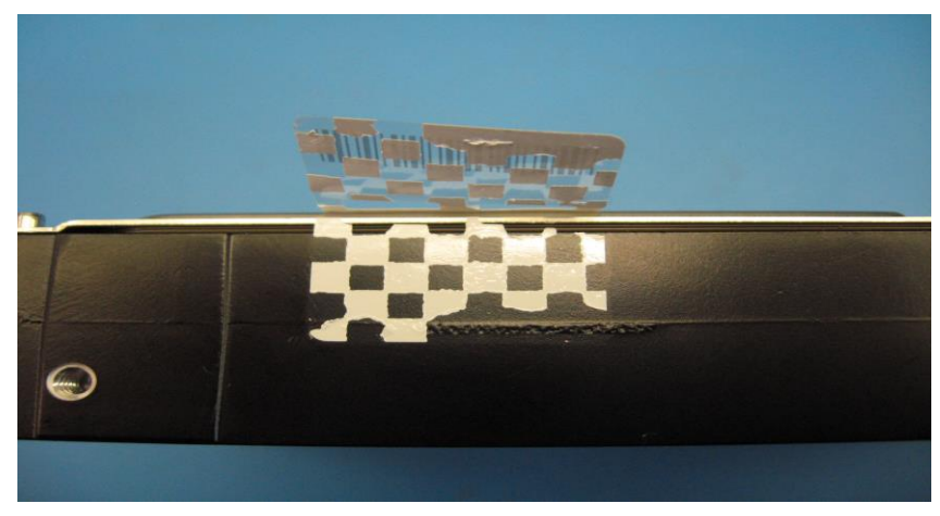
Figure 10: Enterprise Performance HDD v1, 3.5-inch, 10K-RPM, SAS Interface & Enterprise Performance HDD v6, 2.5-Inch, 15K-RPM, SAS Interface module Top Cover Tamper Evidence