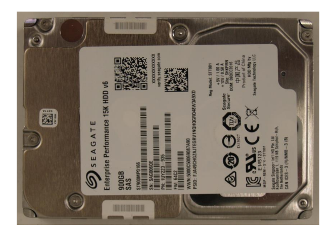
Figure 4: Top view of tamper-evidence label on sides of Enterprise Performance HDD v6, 2.5-Inch, 15K-RPM, SAS Interface module