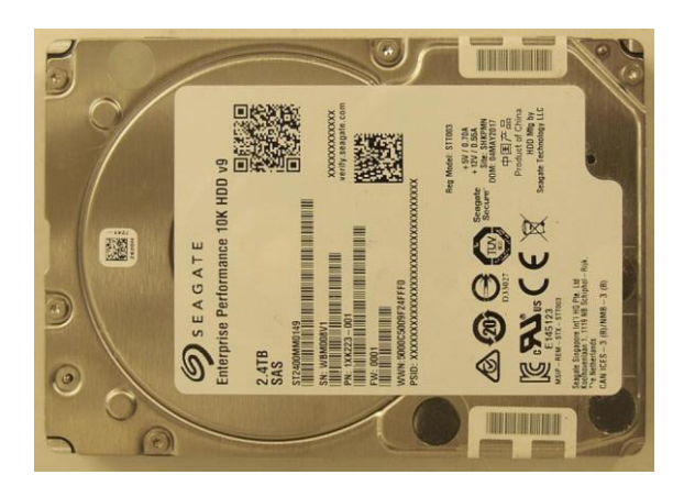
Figure 7: Top view of tamper-evidence label on sides of Enterprise Performance HDD v9, 2.5-Inch, 10K-RPM, SAS Interface module