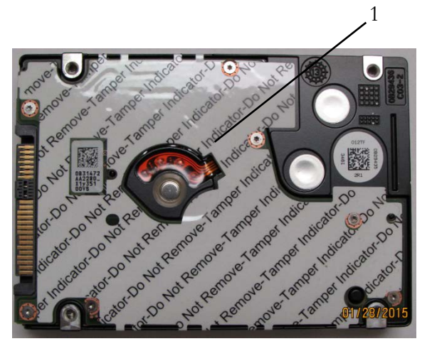
Figure 2: Large Tamper-Evident Label Hardware Version (2)

The tamper evident security labels cannot be easily replicated.