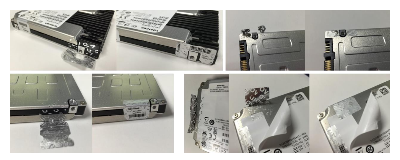
Mark of alphabetic character(s) which constitute a word "VOID"