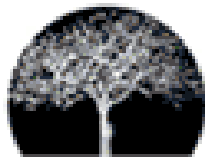
Bronx Lab School