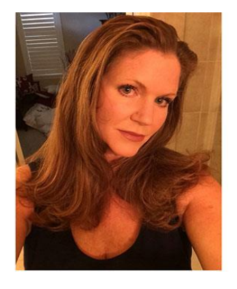
2014 FISSEA Educator of the Year Presented Posthumously to

Nomination information see <a href="http://csrc.nist.gov/organizations/fissea/educator-year/recipients.shtml">http://csrc.nist.gov/organizations/fissea/educator-year/recipients.shtml</a>