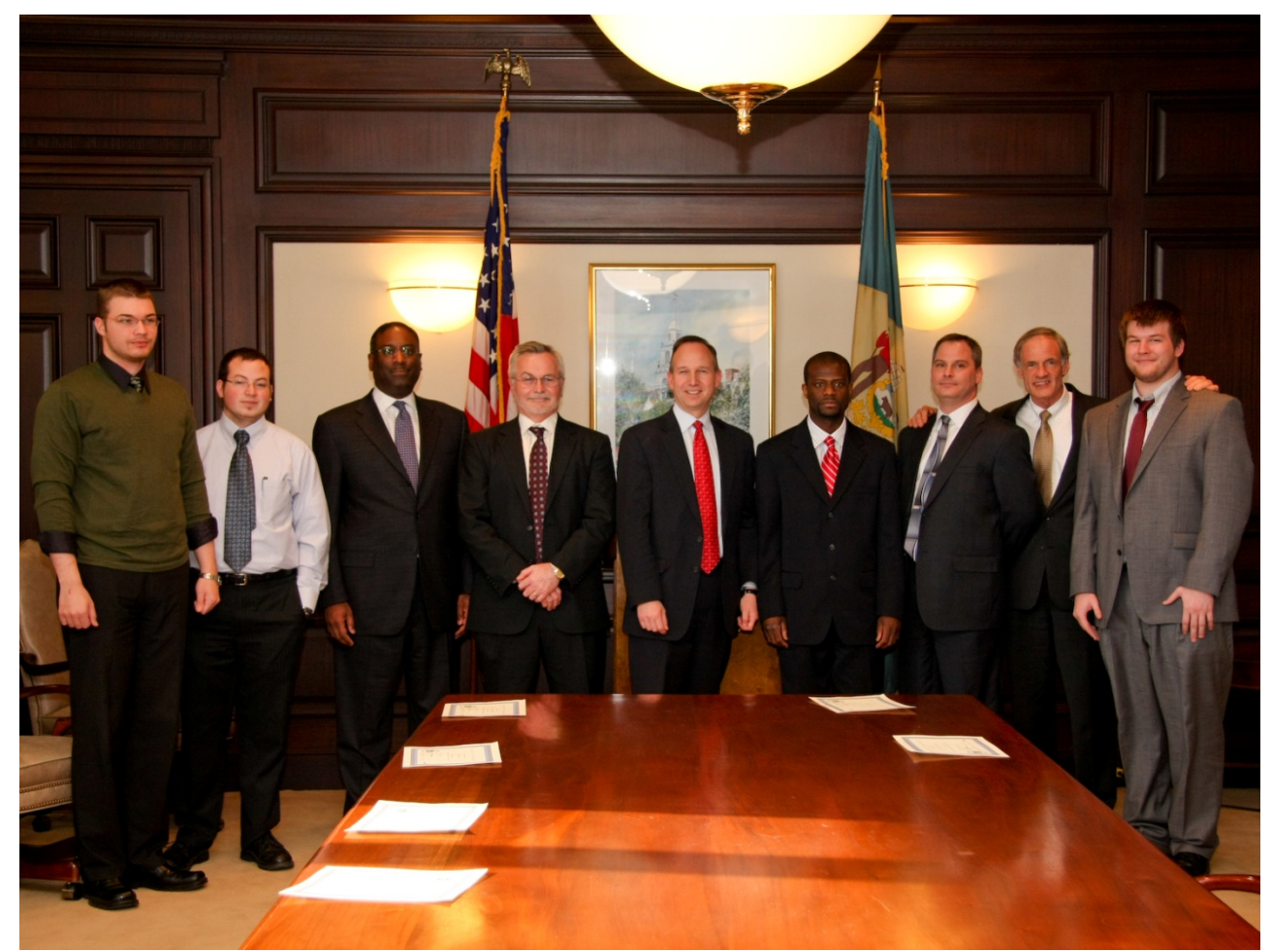
Jan. 15th 2009 - Governor Markell and Senator Carper Honor the Team