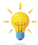
Suggest a Topic/Speaker