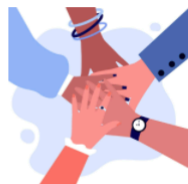
Meet the Forum Team