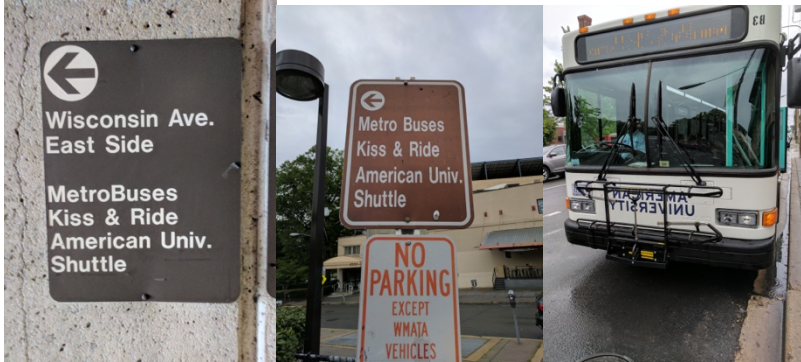
Sign at Top of Escalator Sign Leading to Shuttles Shuttle Bus

Look for the signs for the AU shuttle. Shuttle is free and no AU ID is needed to ride.