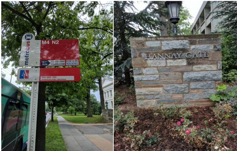
Shuttle Stop Hannay Gate Sign at Stop

Take Shuttle Bus Down Nebraska Avenue to the second stop by Hannay Gate.