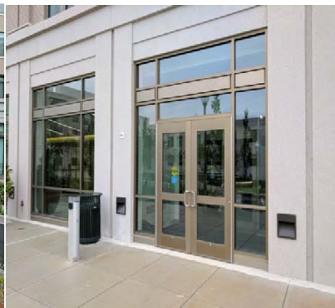
Meeting Location Entrance