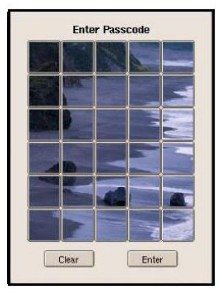
Figure 1: Example PDA Screens<sup>2</sup>

A message area at the top of the display guides the user actions. The buttons at the bottom allow the user to clear out incorrect input or submit an entered image sequence for verification. When an image sequence is initially enrolled, users can choose from among several available predefined themes. An option exists to shuffle images between authentication attempts, where appropriate for the theme, to make input monitoring by a bystander difficult. While each thumbnail image is distinct and individually recognizable, several of them may be used collectively to form a larger mosaic image. Users may define new themes using a theme builder tool and their own images.