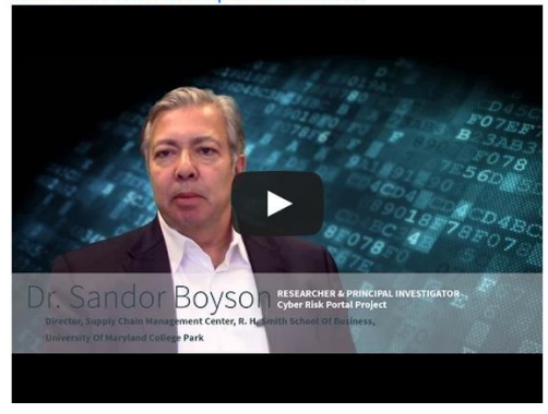
View Tutorial: How to complete Assessments

Please note: Each tab will become visible upon the completion each section, in the order they are presented to you. Once you have completed these parts, you will have access to the results listed under the Executive Dashboard. IMPORTANT: the Executive Dashboard tab will not be visible until you have completed ALL Enterprise Assessments