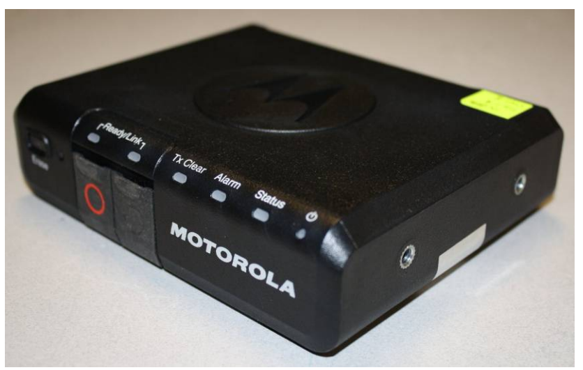
Figure 2: KMF CryptR (Top/Front/Right)

No maintenance access interface is available.