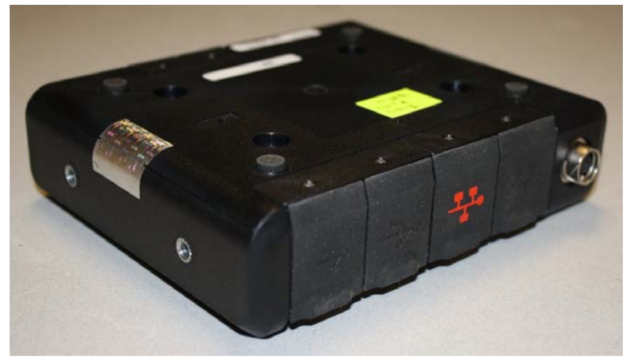
Figure 3: KMF CryptR (Underside/Rear/Left)