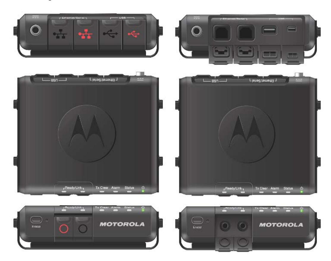
Figure 1: KMF CryptR

The KMF CryptR cryptographic boundary is drawn around the entire product which includes the housing, various IC's, FLASH, RAM, and Printed Circuit Board as shown below.