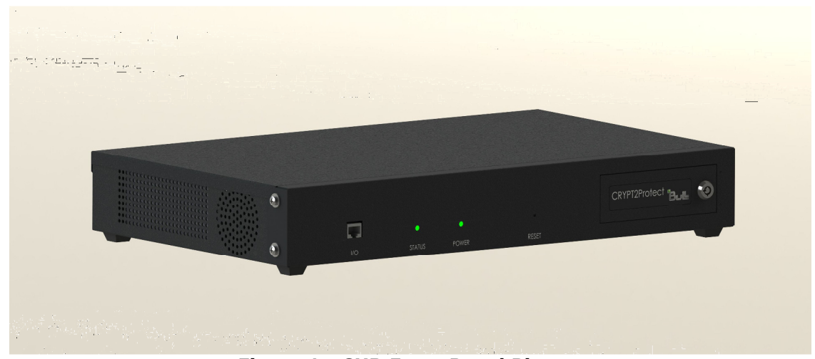
Figure 1 - CHR Front Panel Picture

The CHR V005/A is the corner stone of a range of security products developed and signed by BULL as Application Provider and known as "CRYPT2Pay HR" and "CRYPT2Protect HR" product ranges. Additional products may be developed by Application Providers, based on the CHR.