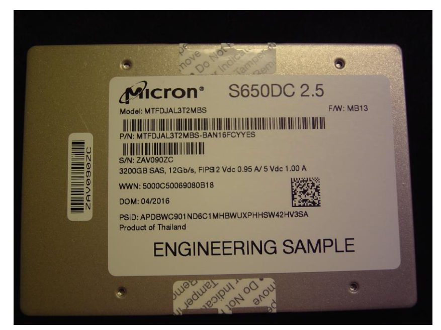
Figure 1: Top view of tamper-evidence label on sides of drive