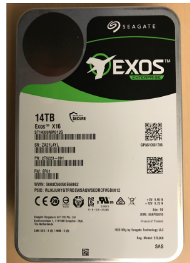
Exos™ X16 Enterprise, 3.5", 7.2 K-RPM, SAS Interface, 14TB