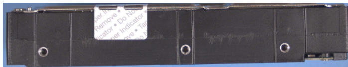
Figure 3: Right-side view of tamper-evidence label on right side of Enterprise Performance HDD v1, 3.5-inch, 10K-RPM, SAS Interface module