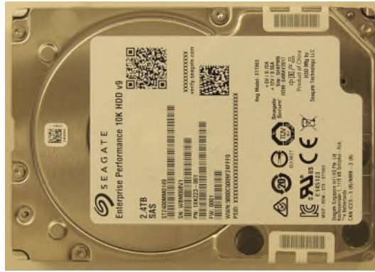
Figure 7: Top view of tamper-evidence label on sides of Enterprise Performance HDD v9, 2.5-Inch, 10K-RPM, SAS Interface module