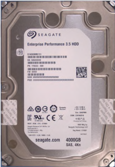
Enterprise Performance® HDD v1, 3.5", 10K-RPM, SAS Interface, 4000GB

This document is non-proprietary and may be reproduced in its original entirety.