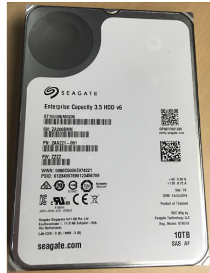
Enterprise Capacity® HDD v6, 3.5", 7K-RPM, SAS Interface, 10,000GB