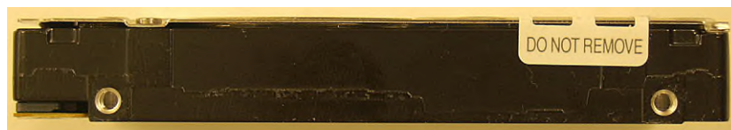
Figure 8: Left-side view of tamper-evidence label on left side of Enterprise Performance HDD v9, 2.5-Inch, 10K-RPM, SAS Interface module