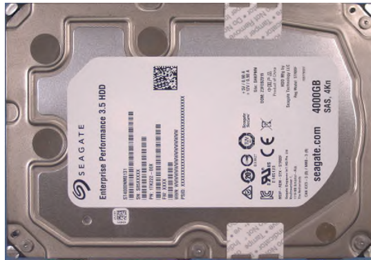
Figure 1: Top view of tamper-evidence label on sides of Enterprise Performance HDD v1, 3.5-inch, 10K-RPM, SAS Interface module