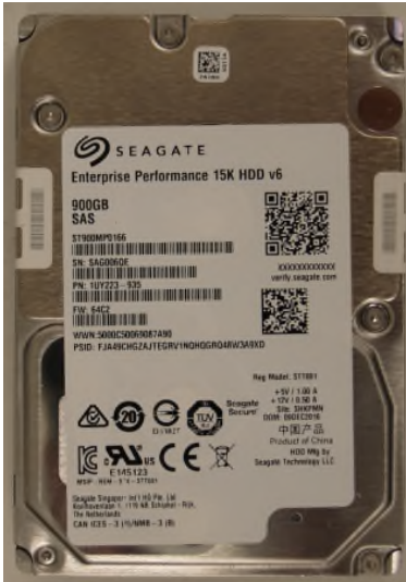
Enterprise Performance® HDD v6, 2.5", 15K-RPM, SAS Interface, 900GB, 600GB