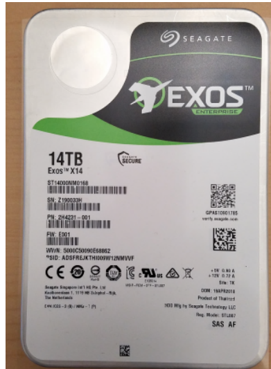
Exos™ X14 Enterprise, 3.5", 7.2 K-RPM, SAS Interface, 14TB