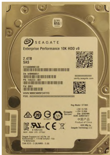
Enterprise Performance® HDD v9, 2.5", 10K-RPM, SAS Interface, 2400GB