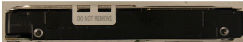
Figure 6: Right-side view of tamper-evidence label on right side of Enterprise Performance HDD v6, 2.5-Inch, 15K-RPM, SAS Interface module