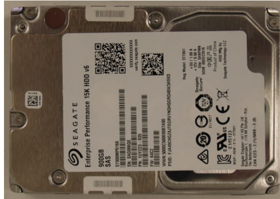
Figure 4: Top view of tamper-evidence label on sides of Enterprise Performance HDD v6, 2.5-Inch, 15K-RPM, SAS Interface module