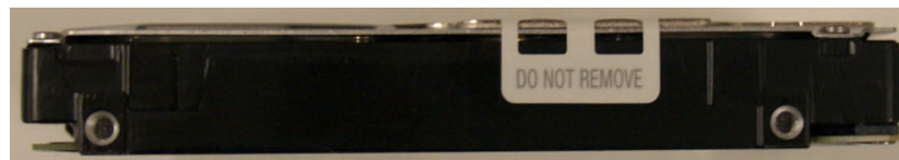
Figure 5: Left-side view of tamper-evidence label on left side of Enterprise Performance HDD v6, 2.5-Inch, 15K-RPM, SAS Interface module