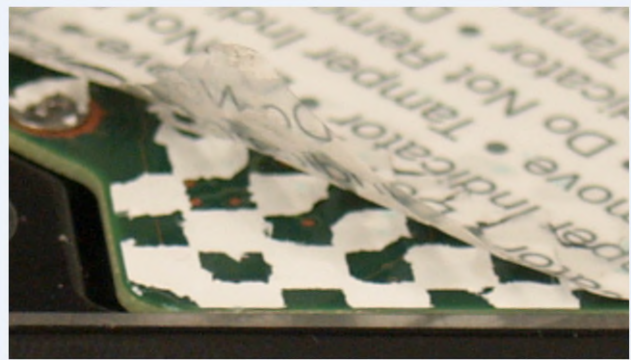
Figure 11: Enterprise Performance HDD v1, 3.5-inch, 10K-RPM, SAS Interface, Enterprise Performance HDD v6, 2.5-Inch, 15K-RPM, SAS Interface, Enterprise Capacity HDD v6, 3.5-inch, 7K-RPM, SAS Interface module PCBA Tamper Evidence. Label lifted off.