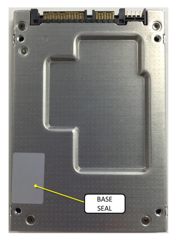
Base plate side