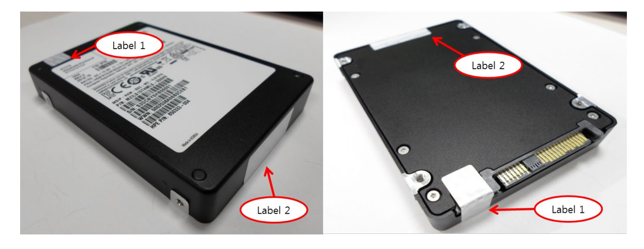
Exhibit 17 - Inspection/Testing of Physical Security Mechanisms (FIPS 140-2 Table C5)