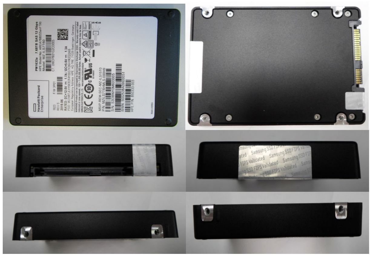
Exhibit 2 – Specification of the Samsung SAS 12G TCG Enterprise SSC SEDs PM1633a Series (MZILS7T6HMLS-000H9) Cryptographic Boundary (From top to bottom – Left to right: top side, bottom side, front side, back side, left side, and right side).