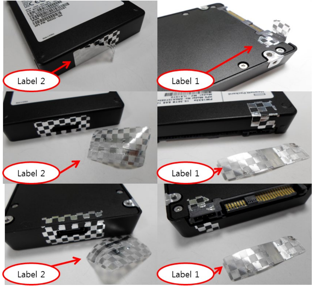
Exhibit 18 – Signs of Tamper