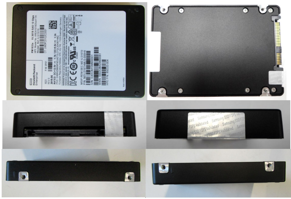
Exhibit 3 – Specification of the Samsung SAS 12G TCG Enterprise SSC SEDs PM1633a Series (MZILS15THMLS-000H9) Cryptographic Boundary (From top to bottom – Left to right: top side, bottom side, front side, back side, left side, and right side).