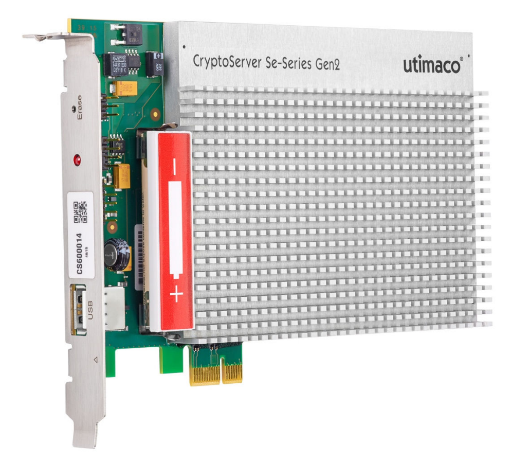
Figure 1 – CryptoServer Se-Series Gen2

For communication with a host the PCIe board offers a PCIe interface and two USB interfaces.