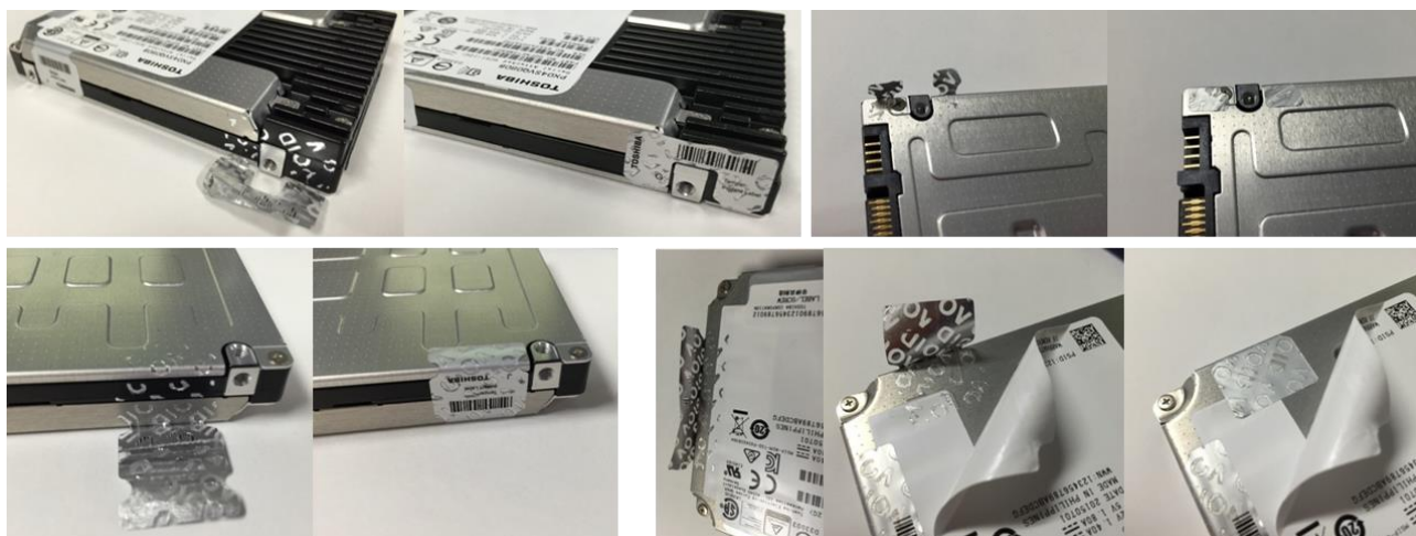
Mark of alphabetic character(s) which constitute a word “VOID”