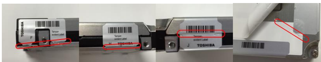
Cutting line (Security seals and OUTER SHEET)