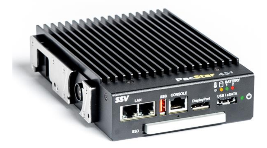
Figure 1: PacStar 451 SSV Small Server