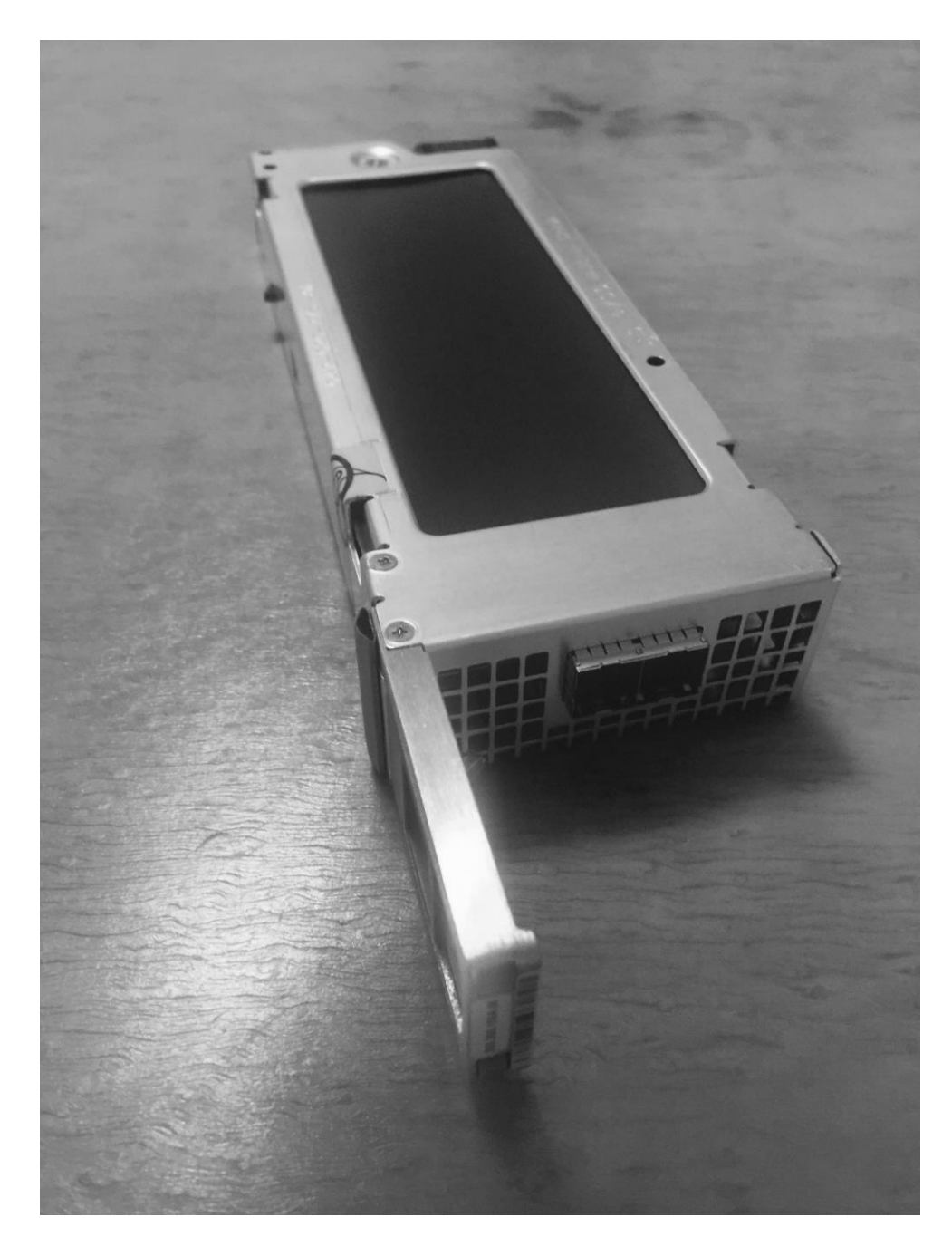
Figure 2 – Physical Boundary (Bottom)

No components are excluded from validation. The module encrypts and decrypts data using only a FIPSapproved mode of operation. It does not have any functional non-approved modes or bypass capability.