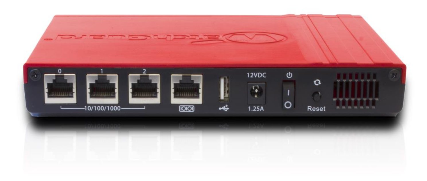
Figure 3: T10 Rear View