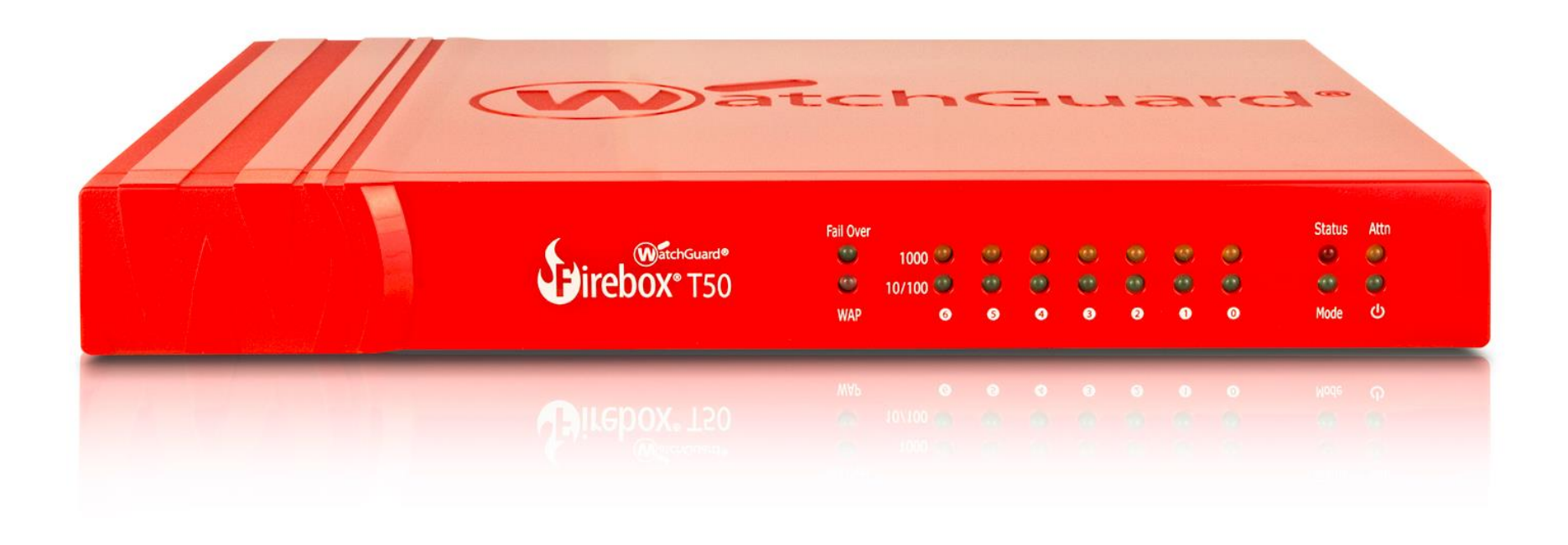
Figure 12: T50-W Front View