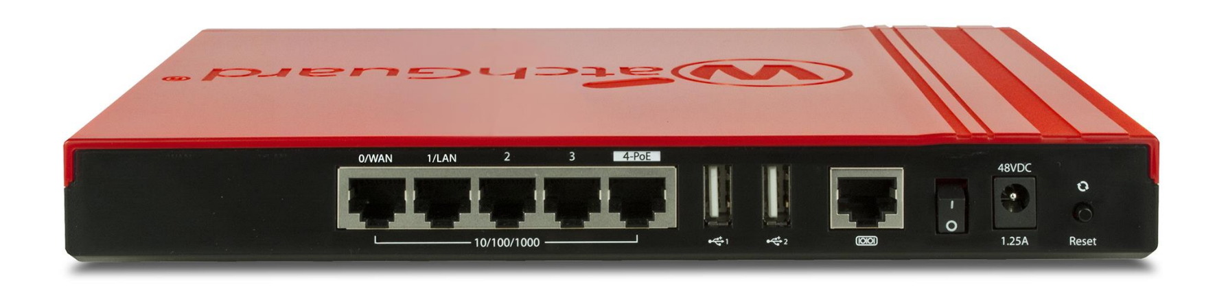
Figure 9: T30-W Rear View