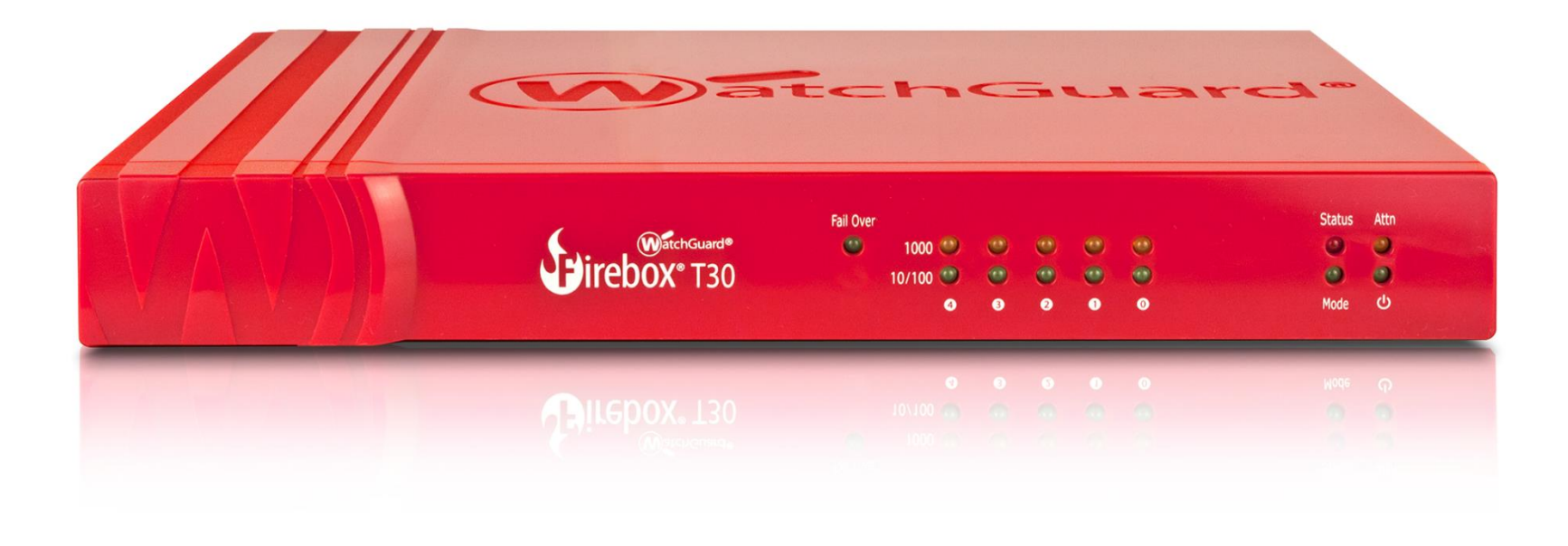
Figure 6: T30 Front View