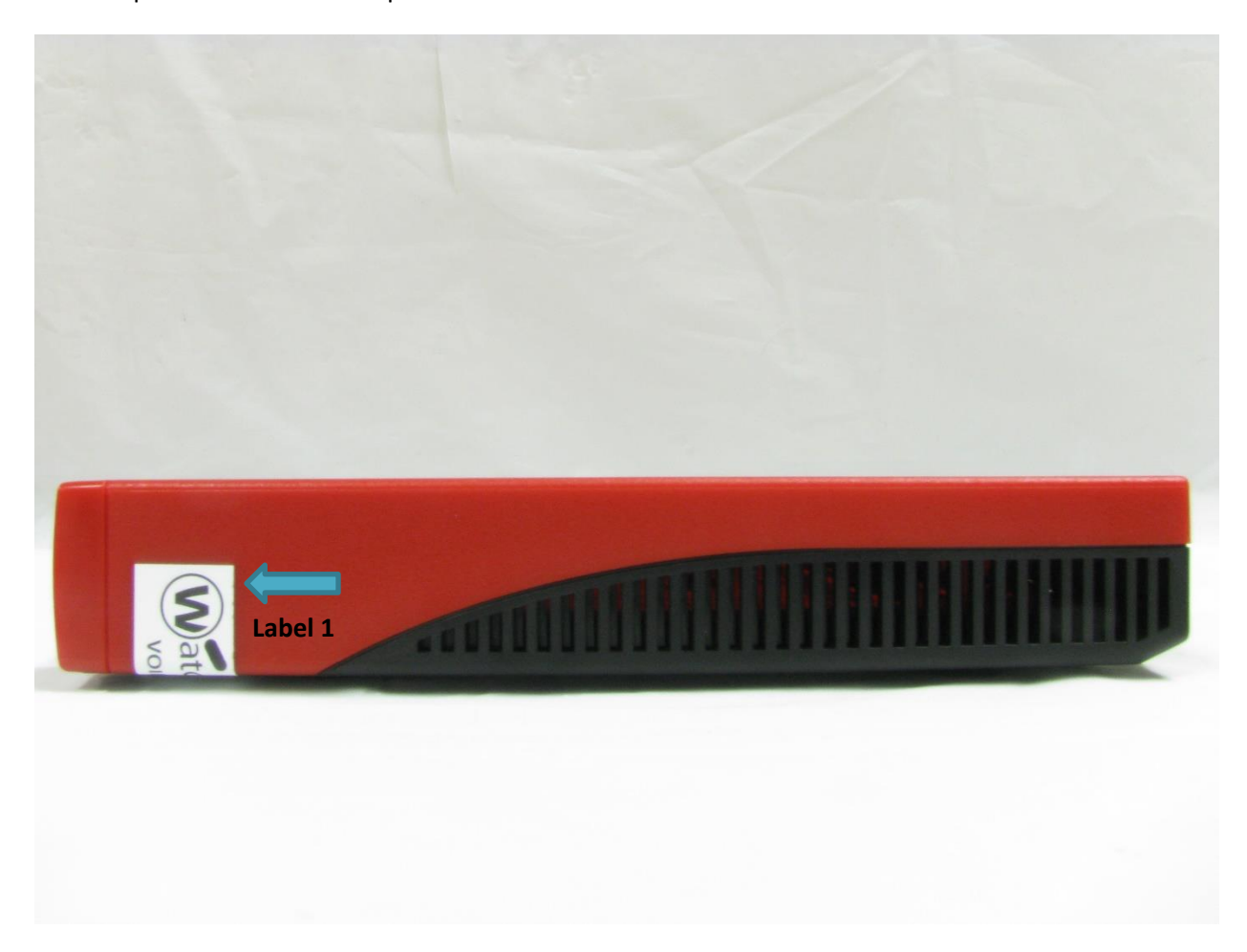
Figure 17: T30 Tamper Evident Label 1 Placement