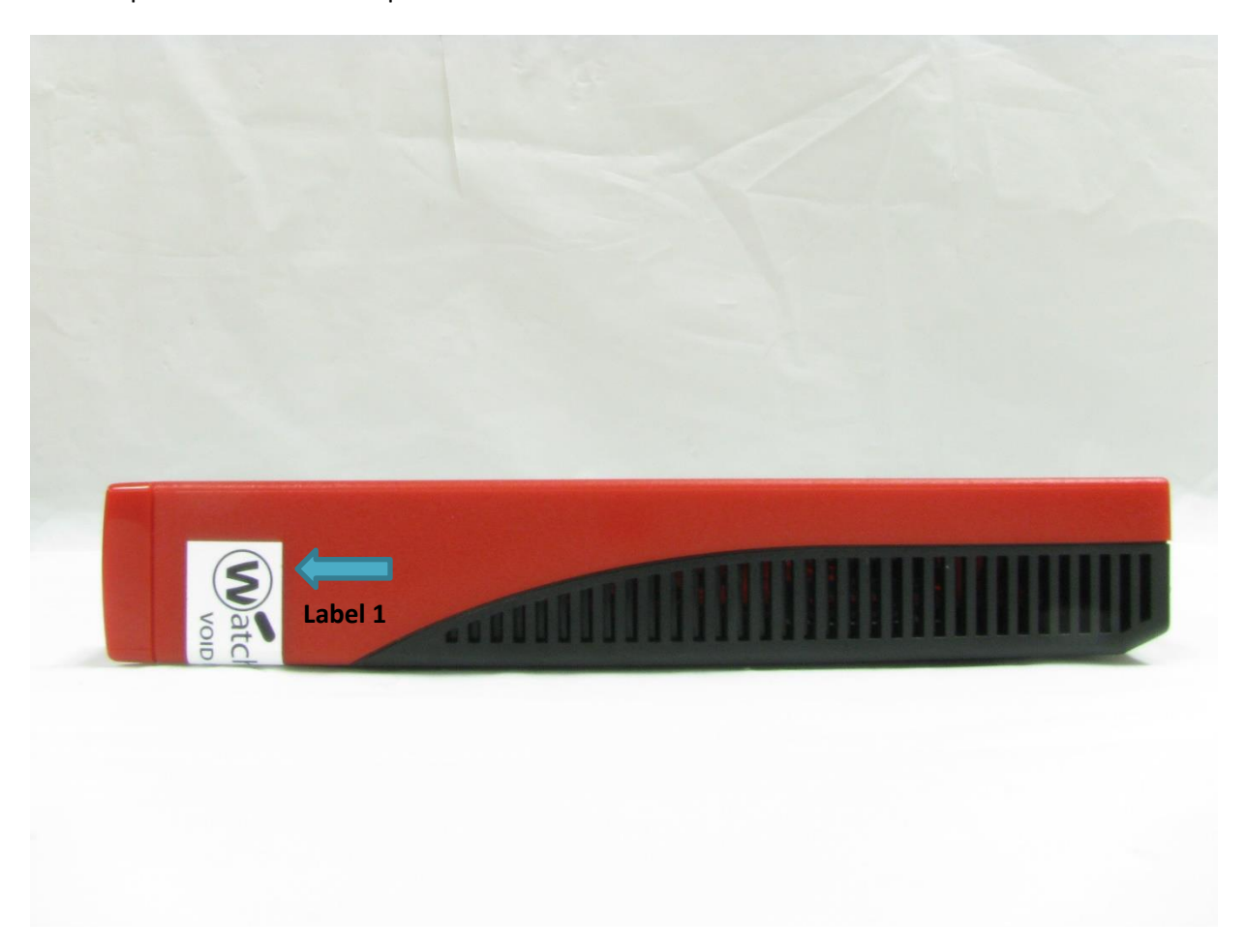
Figure 18: T30-W Tamper Evident Label 1 Placement