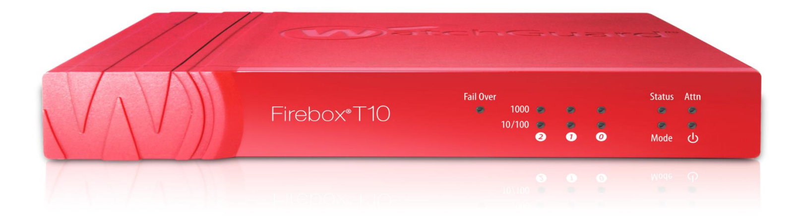
Figure 2: T10 Front View