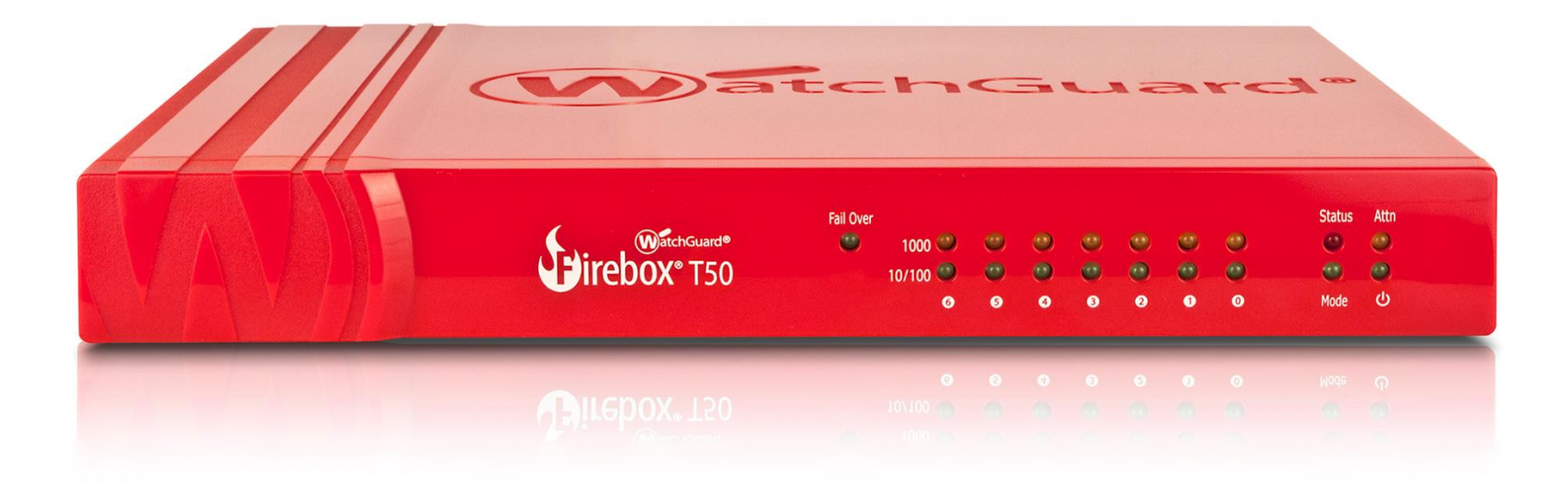
Figure 10: T50 Front View