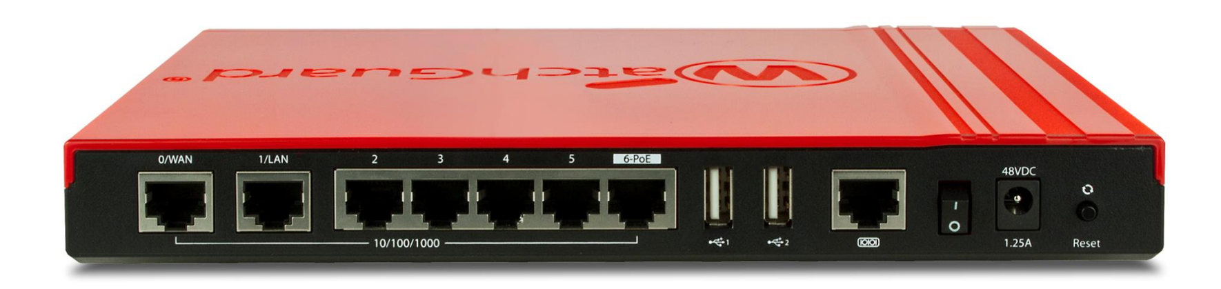
Figure 13: T50-W Rear View