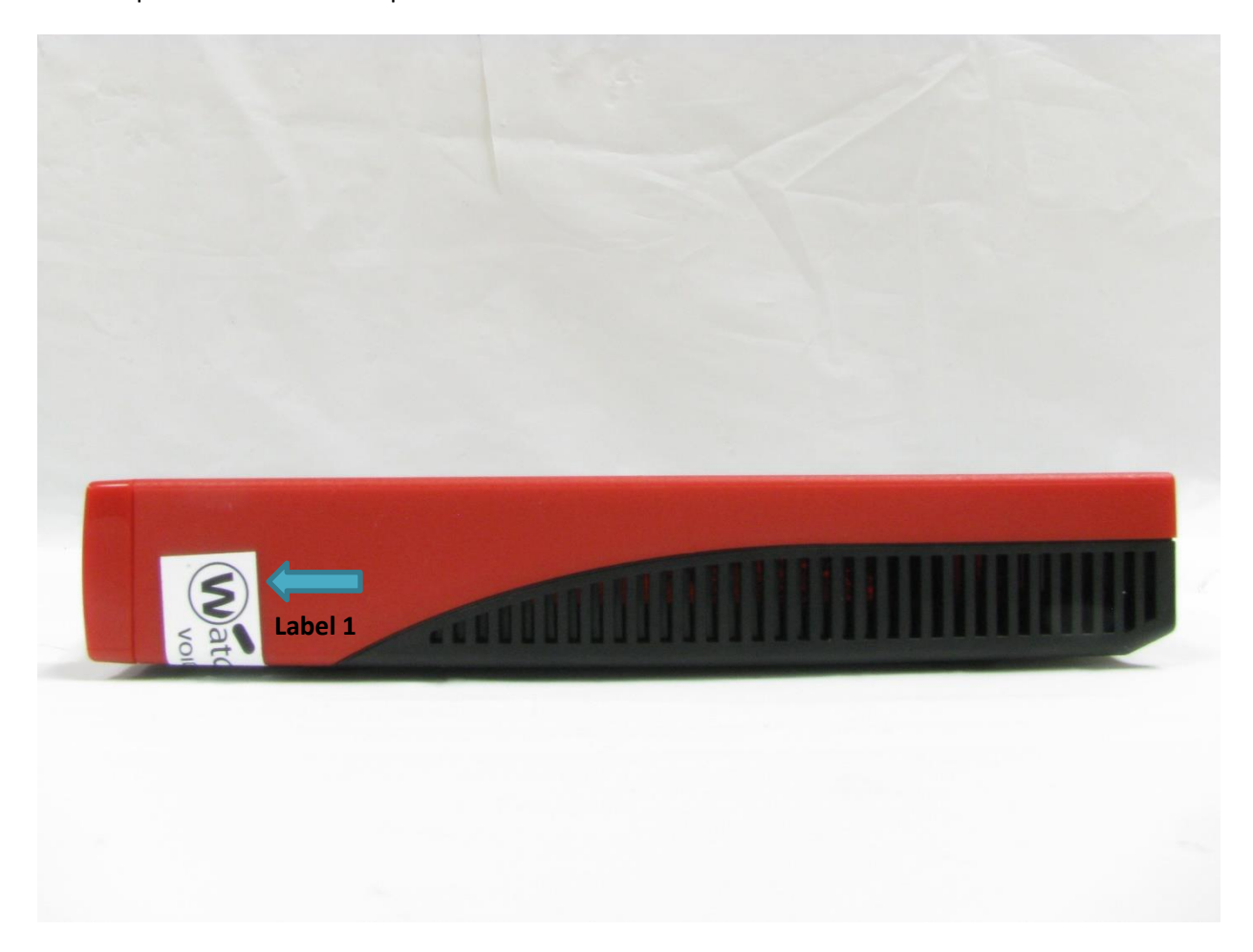
Figure 19: T50 Tamper Evident Label 1 Placement