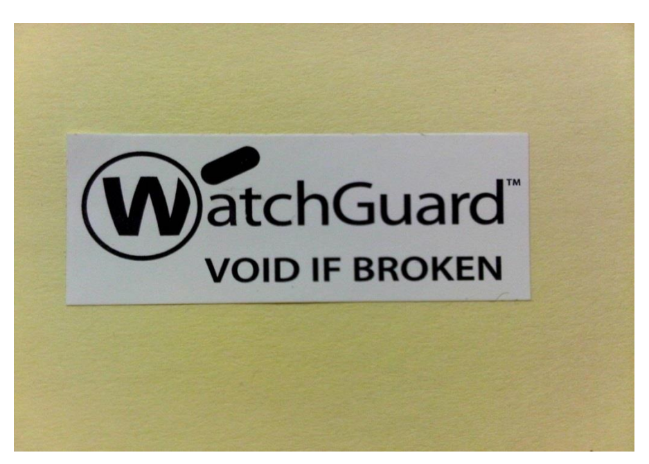
Figure 14: WatchGuard Firebox Tamper Evident Label

The following is a photograph of the tamper evident labels that are used.