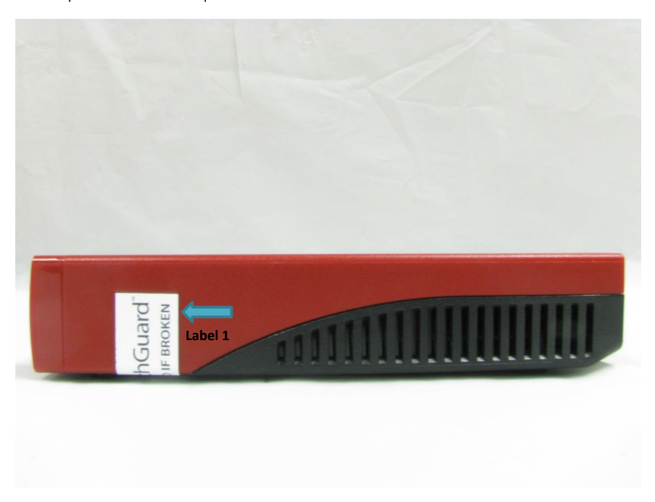
Figure 15: T10 Tamper Evident Label 1 Placement