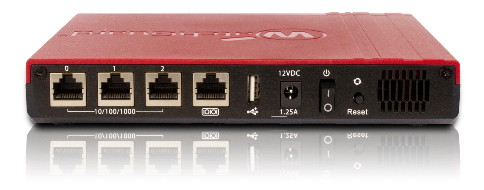
Figure 5: T10-W Rear View