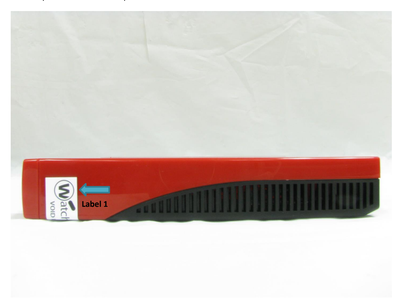
Figure 20: T50-W Tamper Evident Label 1 Placement