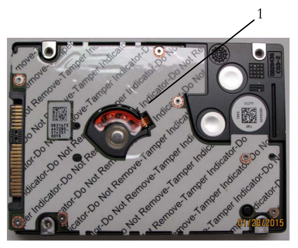
Figure 2: Large Tamper-Evident Label Hardware Version (2)

The tamper evident security labels cannot be easily replicated.