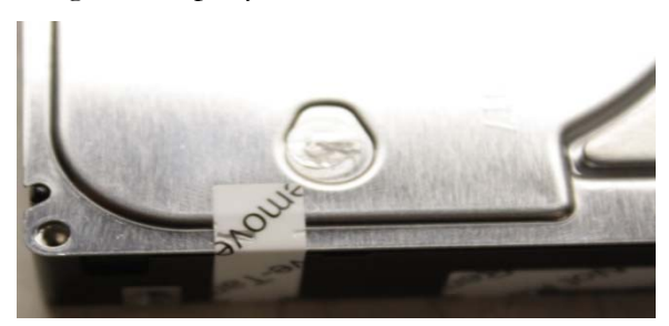
Figure 4: Tamper Evidence on Large Tamper Label