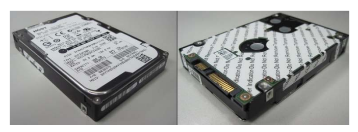
Hardware Version (2)

HGST Ultrastar C15K600 TCG Enterprise HDDs, hereafter referred to as "Ultrastar C15K600" or "the Cryptographic Module" are multi-chip embedded modules that comply with FIPS 140-2 Level 2 security. They also comply with the Trusted Computing Group (TCG) SSC: Enterprise Specification. The drive enclosure is the cryptographic boundary (see Figure 1).