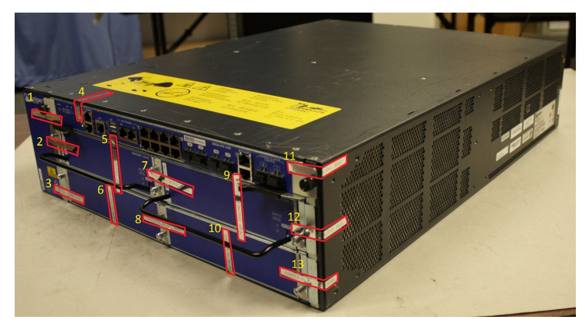
Figure 12: SRX3400 Tamper-Evident Seal Placement on Front and Right Side-13 Tamper Seals

one attaching to the sub-pane directly above it and the right one attaching to the sub-panes both above and below it; and one on the far right sub-pane, attaching to the top pane.