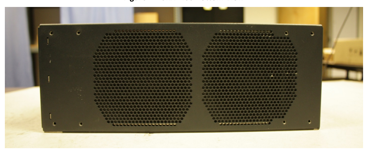
Figure 3 - SRX1400 Left View