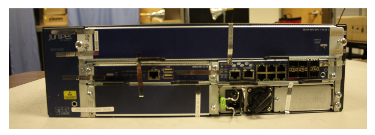
Figure 1 - SRX1400 Front View

The physical forms of the module's various models are depicted in Figures 1-15 below. For all models, the cryptographic boundary is defined as the outer edge of the chassis. The SRX1400 excludes the SRX1K-NPC-SPC-1-10-40 from the requirements of FIPS 140-2 as described in Section 5.2. The module does not rely on external devices for input and output.