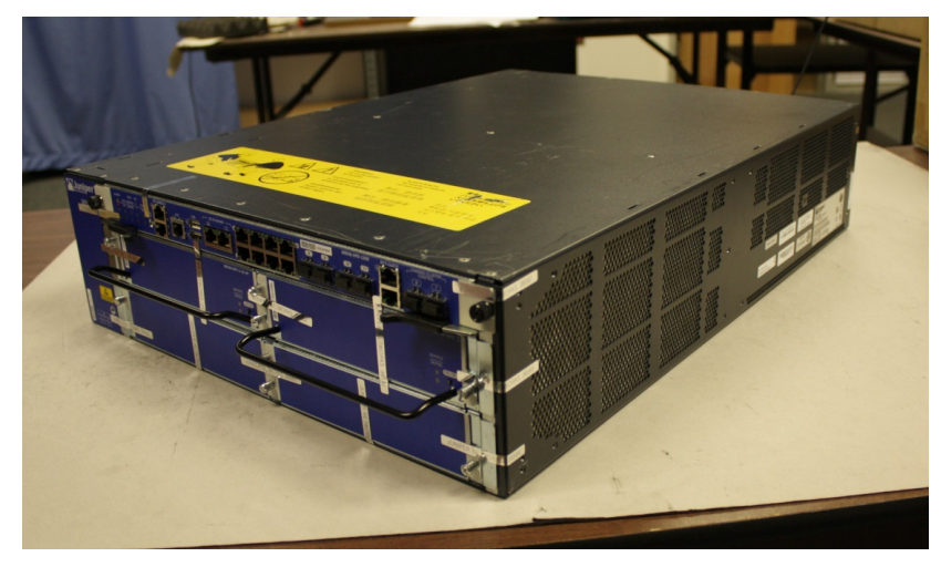
Figure 6 – SRX3400 Top View