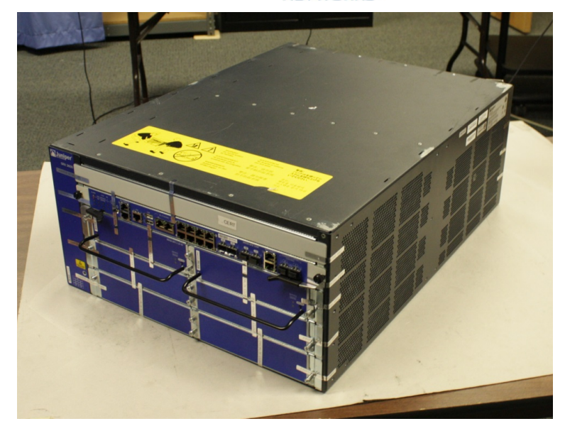
Figure 8 – SRX3600 Top View