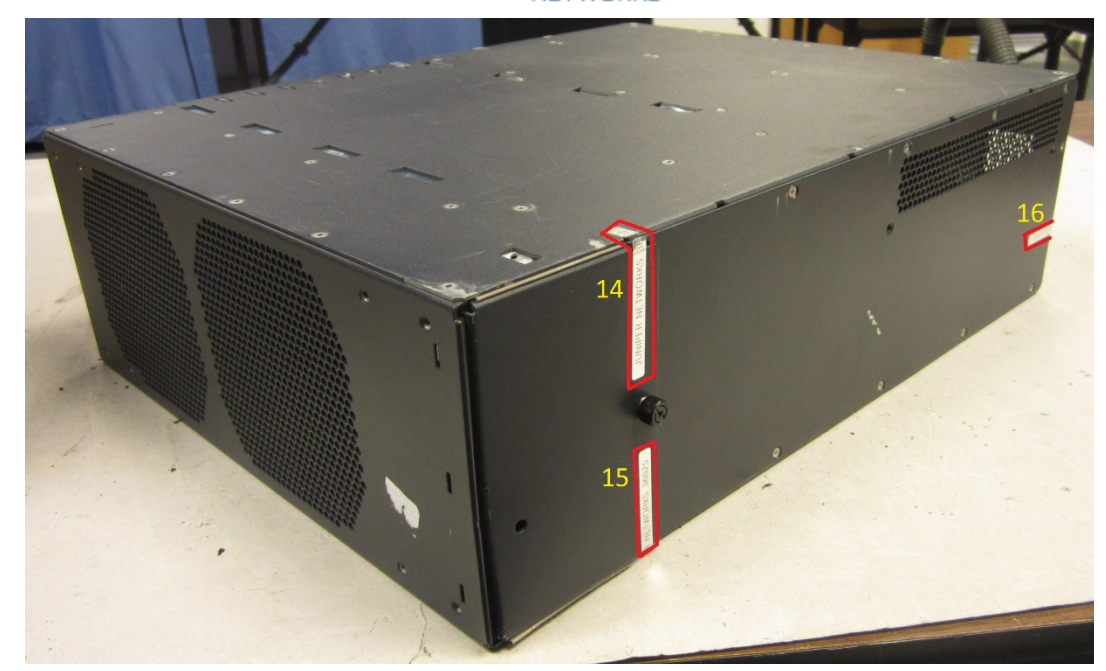
Figure 11: SRX1400 Tamper-Evident Seal Placement on Left Side-Three Tamper Seals