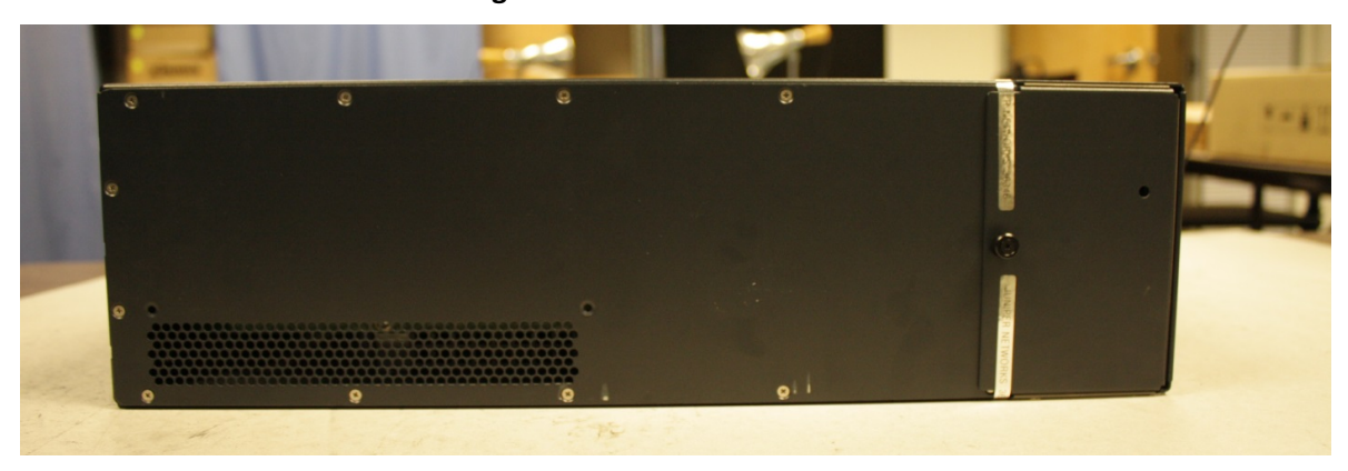
Figure 2 - SRX1400 Bottom View