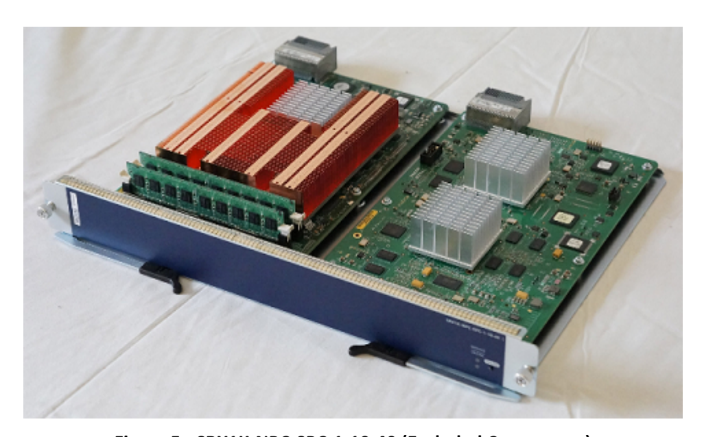
Figure 5 - SRX1K-NPC-SPC-1-10-40 (Excluded Component)