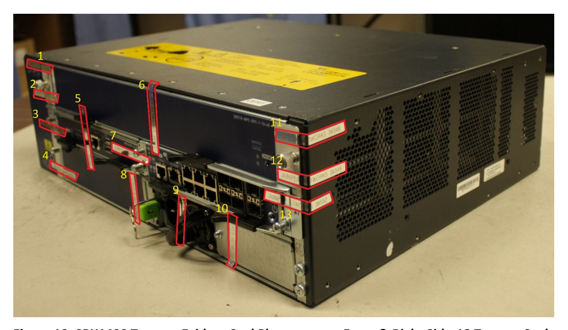
Figure 10: SRX1400 Tamper-Evident Seal Placement on Front & Right Side-13 Tamper Seals