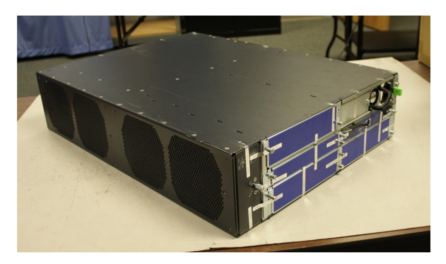
Figure 7 – SRX3400 Bottom View