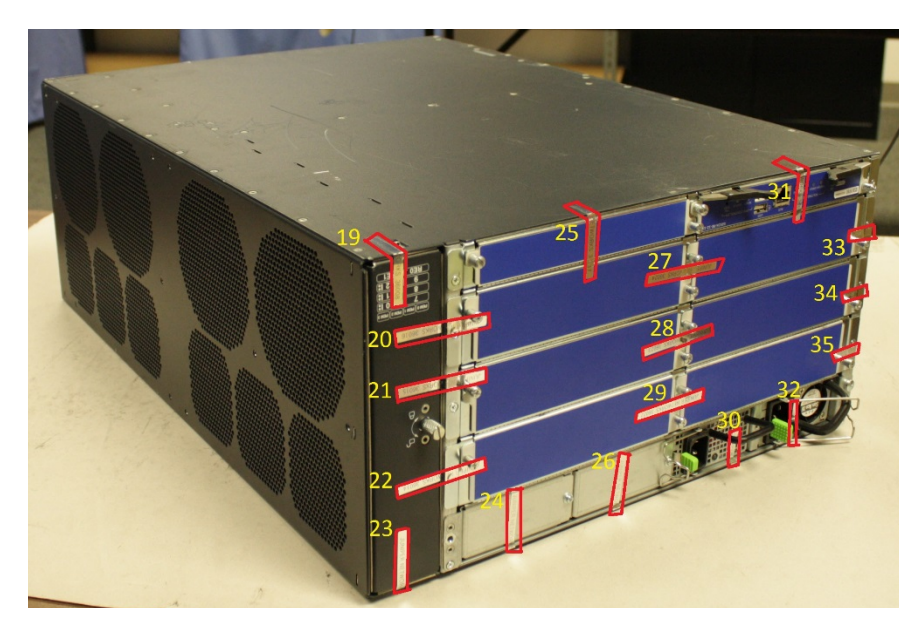
Figure 15: SRX3600 Tamper-Evident Seal Placement on Rear and Bottom- 17 Tamper Seals