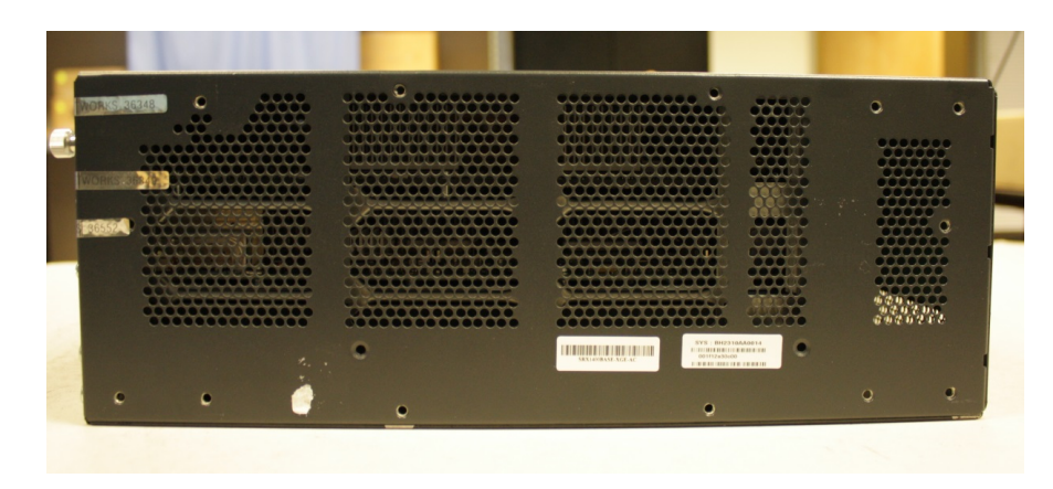
Figure 4 - SRX1400 Right View