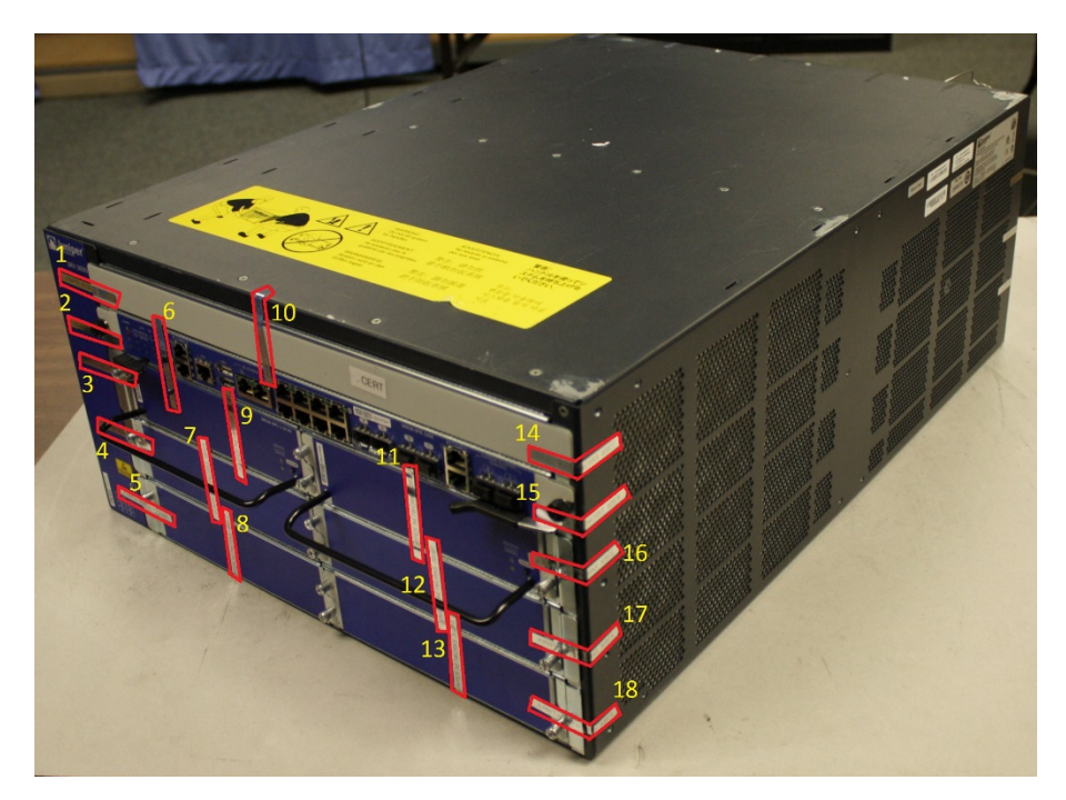
Figure 14: SRX3600 Tamper-Evident Seal Placement on Front and Right Side-18 Tamper Seals