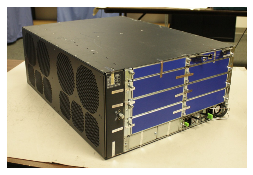
Figure 9 – SRX3600 Bottom View