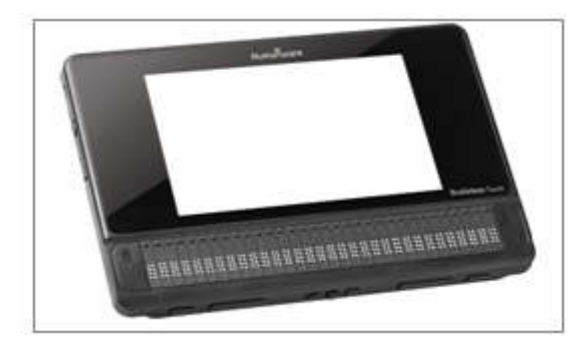
Figure 1 – BrailleNote Touch Tablet

The CM is a multi-chip standalone software module. The physical boundary of the module is the BrailleNote Touch tablet on which the module is installed. The logical boundary is the Humanware Kernel Cryptographic Module which is loaded in the Linux kernel space. The CM always operates in the approved mode.