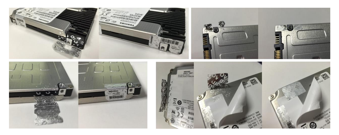
Mark of alphabetic character(s) which constitute a word "VOID"