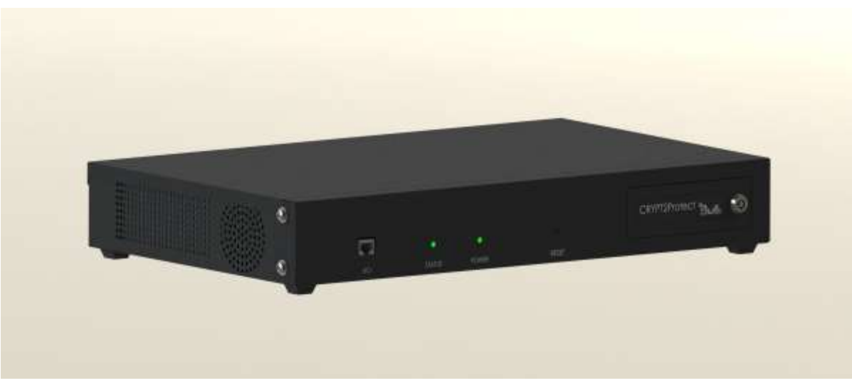
Figure 1 - CHR Front Panel Picture

The CHR V005/B is the corner stone of a range of security products developed and signed by BULL as Application Provider. Additional products may be developed by Application Providers, based on the CHR.