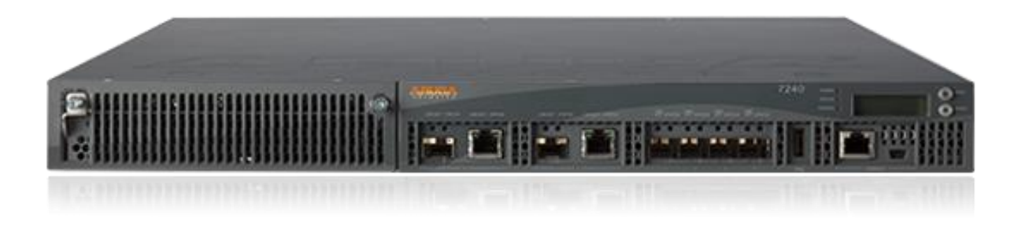
Figure 1 - The Aruba 7200 controller chassis

Figure 1 shows the front of the Aruba 7200 Controller, and illustrates the following: