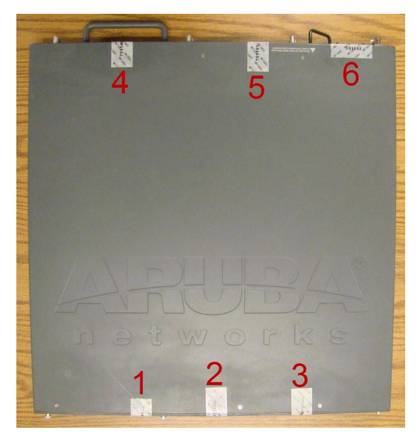
Figure 3 Required TELs for the Aruba 7200 Mobility Controller – Top