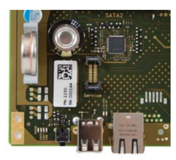
Figure 3 - Etched revision and S/N label

The validated firmware version is equal to: