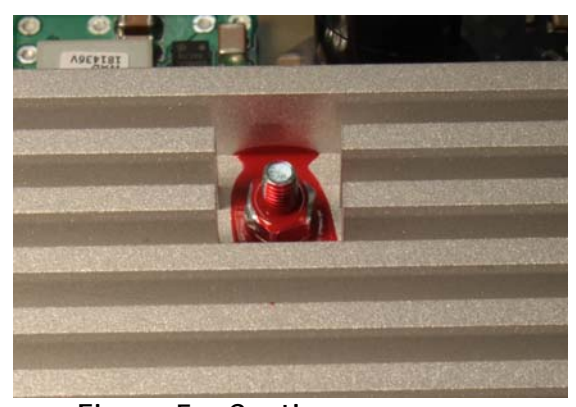
Figure 5 – Coating over screw

The seal-protected cover also acts as a heat sink and forms a hard enclosure in means of FIPS 140-2.