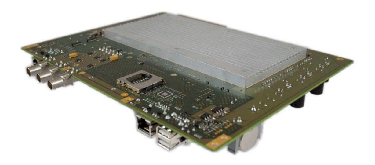
Figure 2 - MVC201 - back