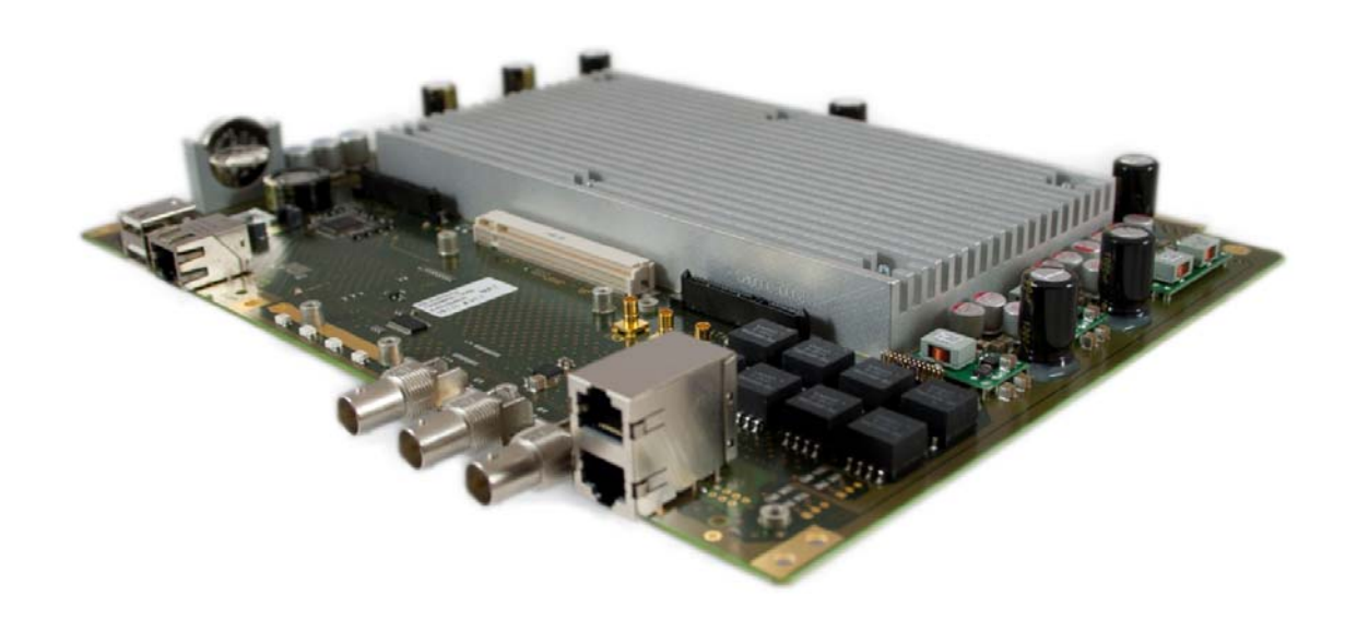
Figure 1 – MVC201 – front

The MVC201 is a printed circuit board (PCB) designed for integration into a Texas Instruments (TI) Series 2 DLP Cinema projector. The module's cryptographic boundary is the outer edge of the PCB. All parts outside the physically protected area on the board are excluded from the requirements of FIPS 140-2 because they are non-security relevant and cannot be used to compromise the security of the module.