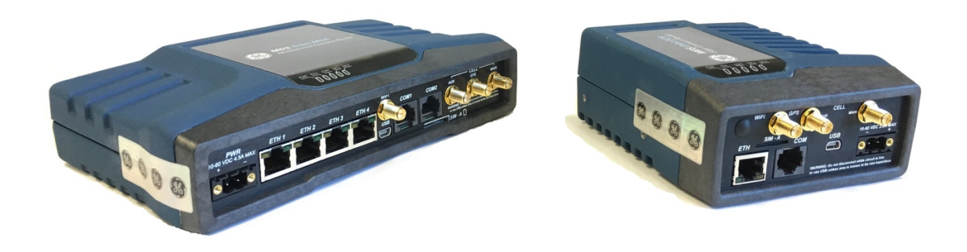
Figure 1 – Module (Large Form Factor on left (MCR), Small Form Factor on right (ECR))

The module has two form factors, both of which have multiple variants. All port possibilities are encompassed in Table 4.