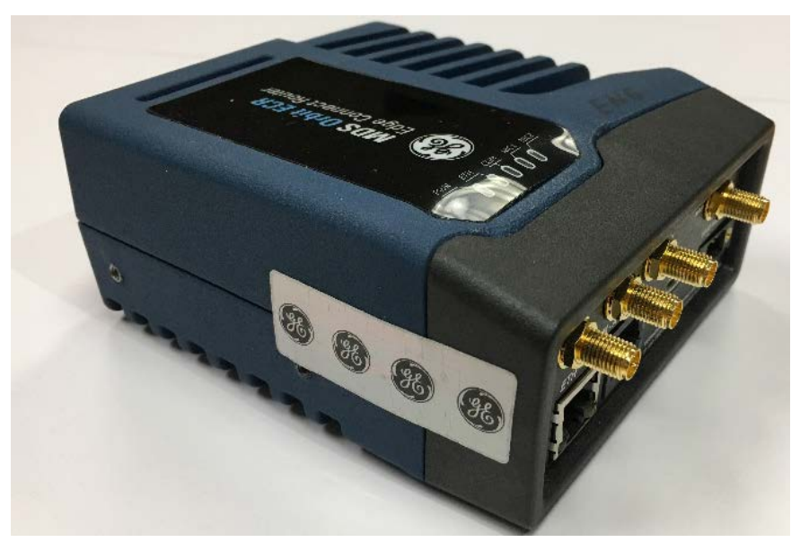
Figure 4 – Tamper Seal Location (Small Form Factor)