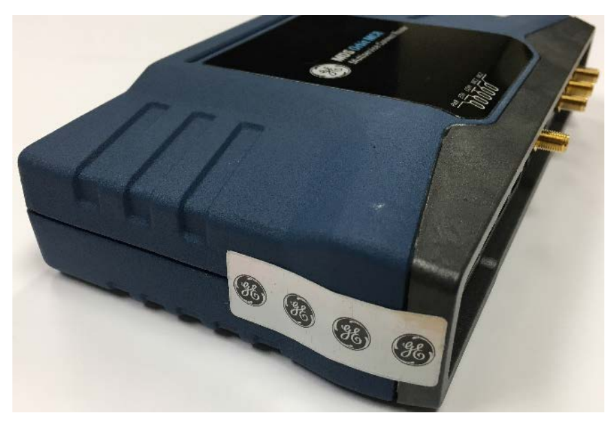
Figure 3 – Tamper Seal Location (Large Form Factor)

The module is encased in a metal enclosure, protected by a tamper-evident seal. Each form factor contains one (1) seal, which is placed on the left side of the device in the factory (see Figures 3 and 4). Ensure the seal is in-place at the location shown in the figures below, and that neither it nor the module enclosure have been damaged. During operational usage, it is recommended to inspect the seal and enclosure once every three months (Table 18). If the magnetometer (see Section 7) is active and calibrated, it is also recommended to inspect the tamper seal if the magnetometer logs an event.