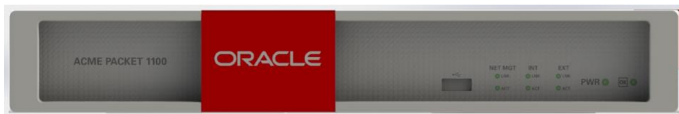
Figure 1: Acme Packet 1100

A representation of the cryptographic boundary is defined below: