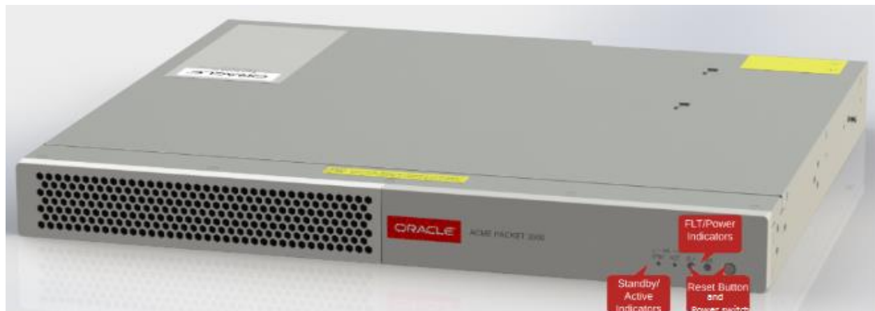
Figure 5: Acme Packet 3900 – Front View