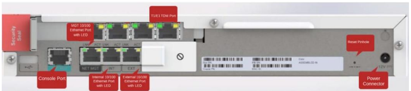
Figure 4: Acme Packet 1100 – Rear View