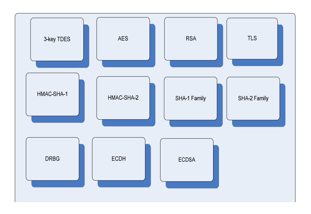
Figure 1 – Logical Cryptographic Boundary

Figure 1 shows the logical cryptographic boundary of the kernel. The module provides a set of cryptographic services (API calls) in areas such as Transport Layer Security (TLS) and SP800-90A DRBG.