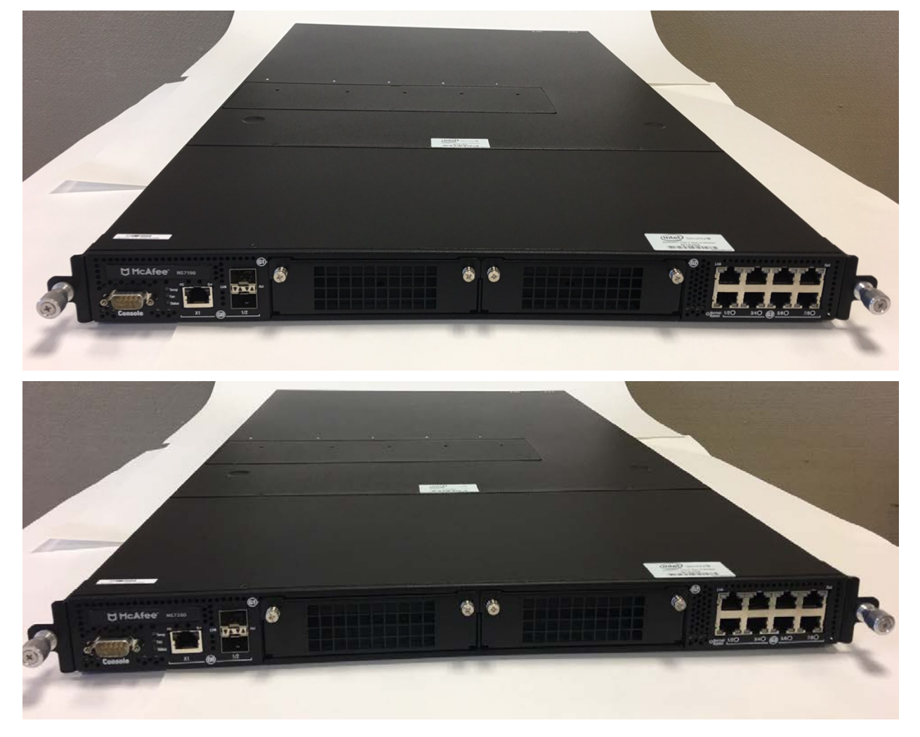
Figure 1 – Images of NS7150/NS7250/NS7350

Figure 1 shows the module configuration and the cryptographic boundaries.