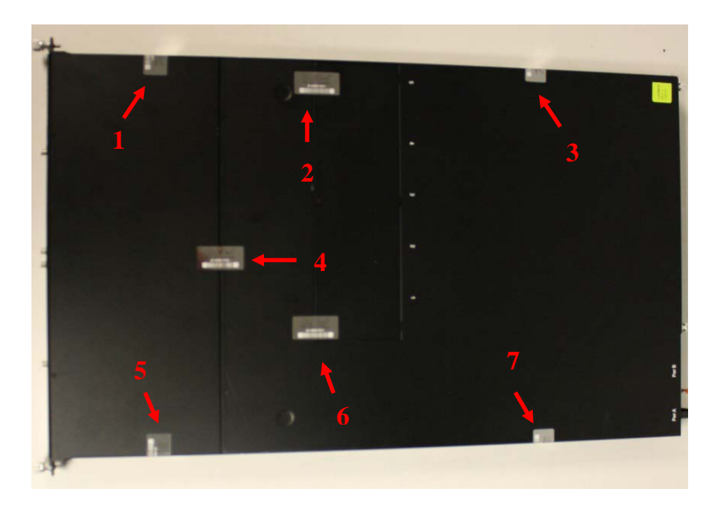
Figure 4 depicts the tamper seal locations on the cryptographic module for the NS7150/NS7250/NS7350 platforms. There are seven (7) tamper-evident seals and they are numbered in red.